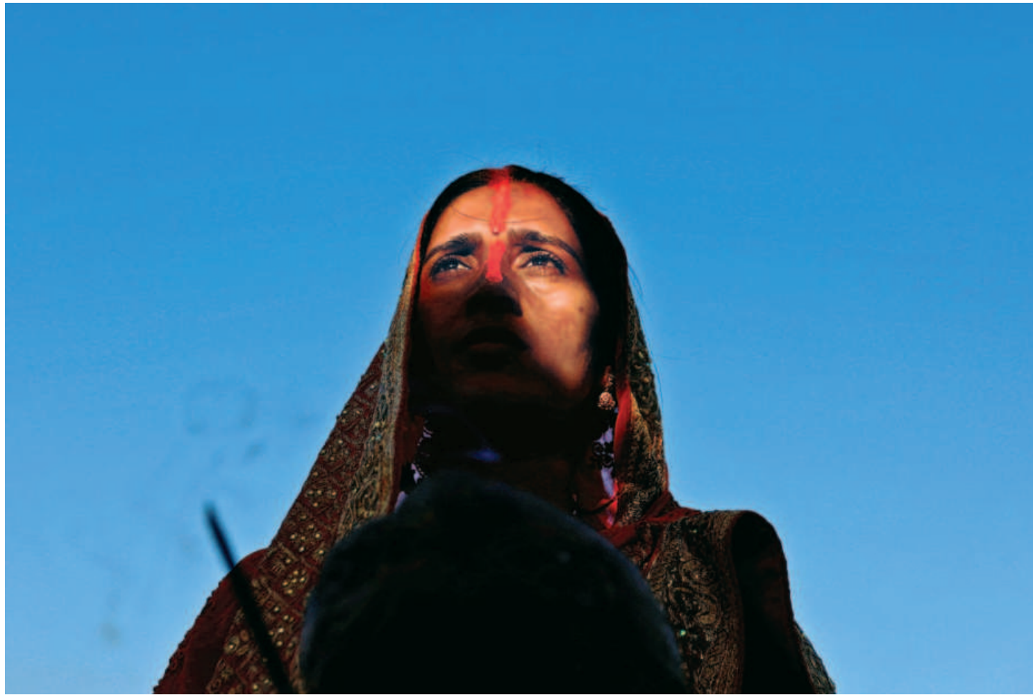
Light illuminates a devotee worshipping the Sun god on the bank of the Bagmati River, during the Hindu religious festival of Chhath in Lalitpur, Nepal, yesterday.

Singer-songwriter Fally Ipupa, "like all Congolese singers", had arrived several hours after the show had been scheduled to start, the agency noted.