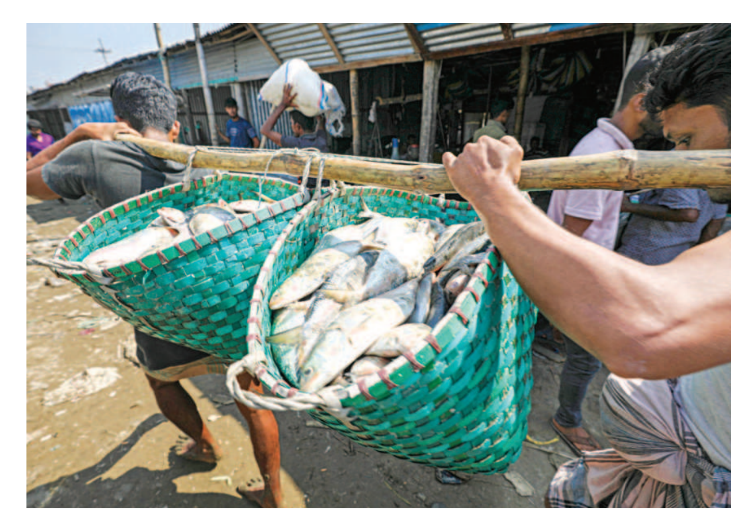
Some fishermen in Chattogram's Jelepara returning from the Bay of Bengal with their catch yesterday. Most of the fishermen in the area are passing days with difficulties as they are yet to recover from the devastation caused by Sitrang.

Earlier this month, the Insolvency and Bankruptcy Board of India amended its regulations to fast-track SEE PAGE 7 COL 4