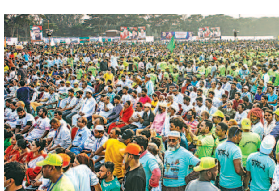
Supporters at yesterday's BNP rally, left, at Collectorate Eidgah in Rangpur. Leaders and activists at the triennial council of Dhaka Zilla Awami League, right, in the capital's She-e-Bangla Nagar yesterday.