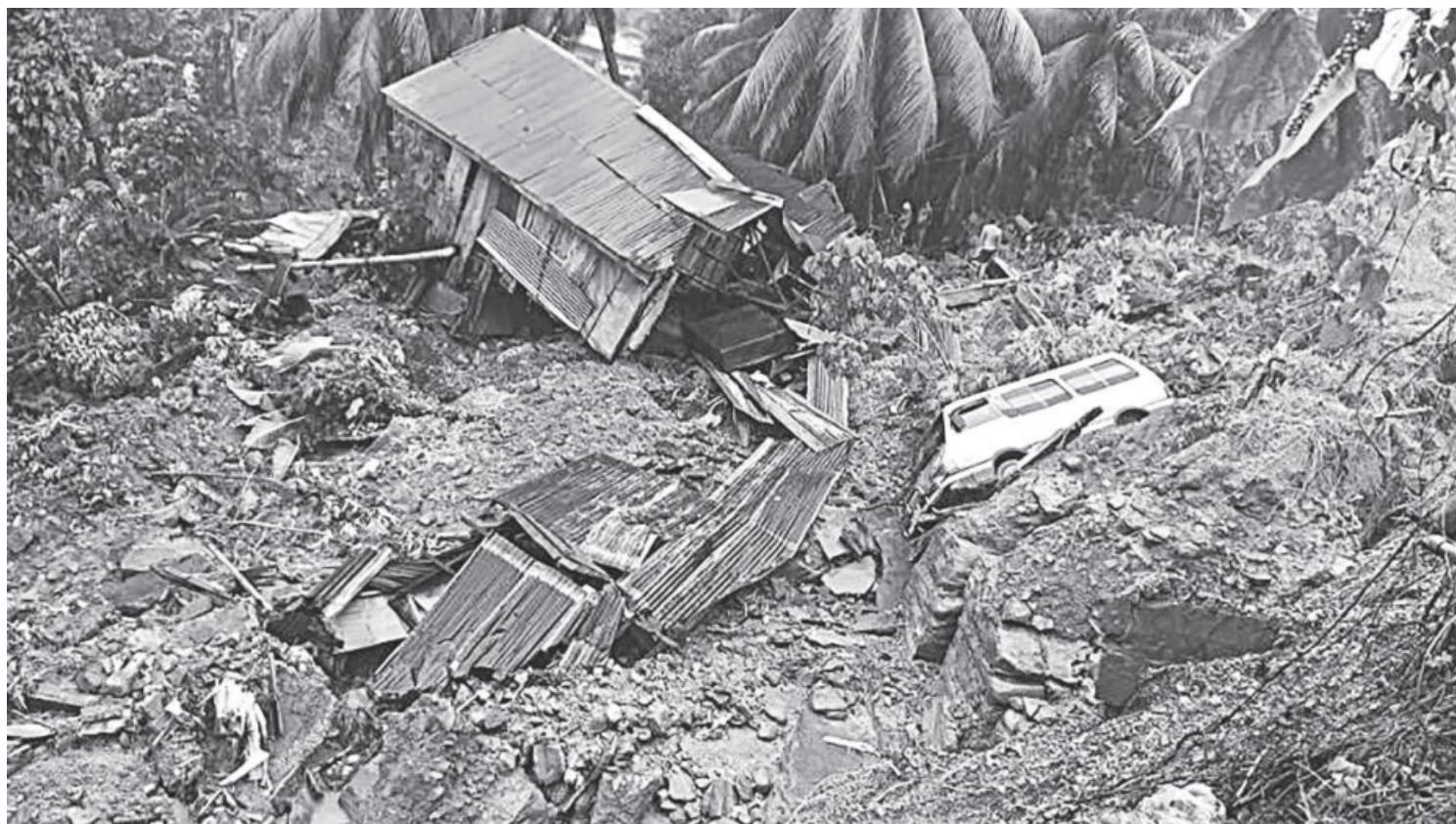
This handout photo shows the destruction brought by heavy rains caused landslides in Parang town in the southern Philippines' Maguindanao province.

"It is very important for us, of course, that Finland and Sweden would join Nato hand in hand," Marin told reporters at a joint press conference in Helsinki with her Swedish counterpart.