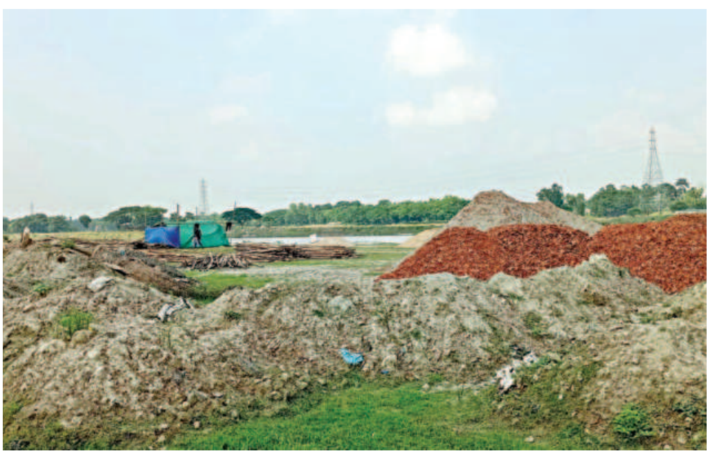
Construction materials, including bricks, concrete and sand, are kept right on the bank of Old Brahmaputra river, further endangering the waterbody, which has already been suffering due to pollution and encroachment. This photo was taken recently.

The office sources said the dengue outbreak intensified in Chattogram since June. Earlier, nine people were infected in SEE PAGE 4 COL 8