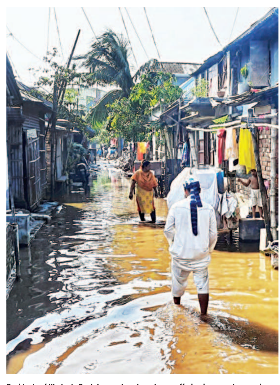
Residents of Khulna's Bastuhara colony have been suffering immensely ever since cyclone Sitrang rocked the country five days ago. Many areas have knee- to waistdeep water, which has confined residents to their homes.