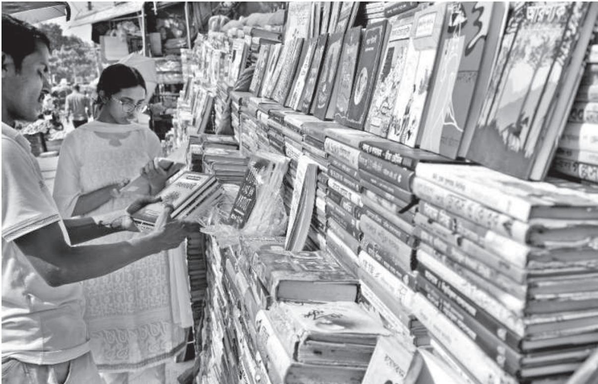
A roadside bookseller shows his offerings to a potential customer. Nilkhet is a sacred place for book lovers in Dhaka, for the availability of all genres of books at an affordable price. Some of the sellers have set up footpath shops to meet the cravings of bookworms.