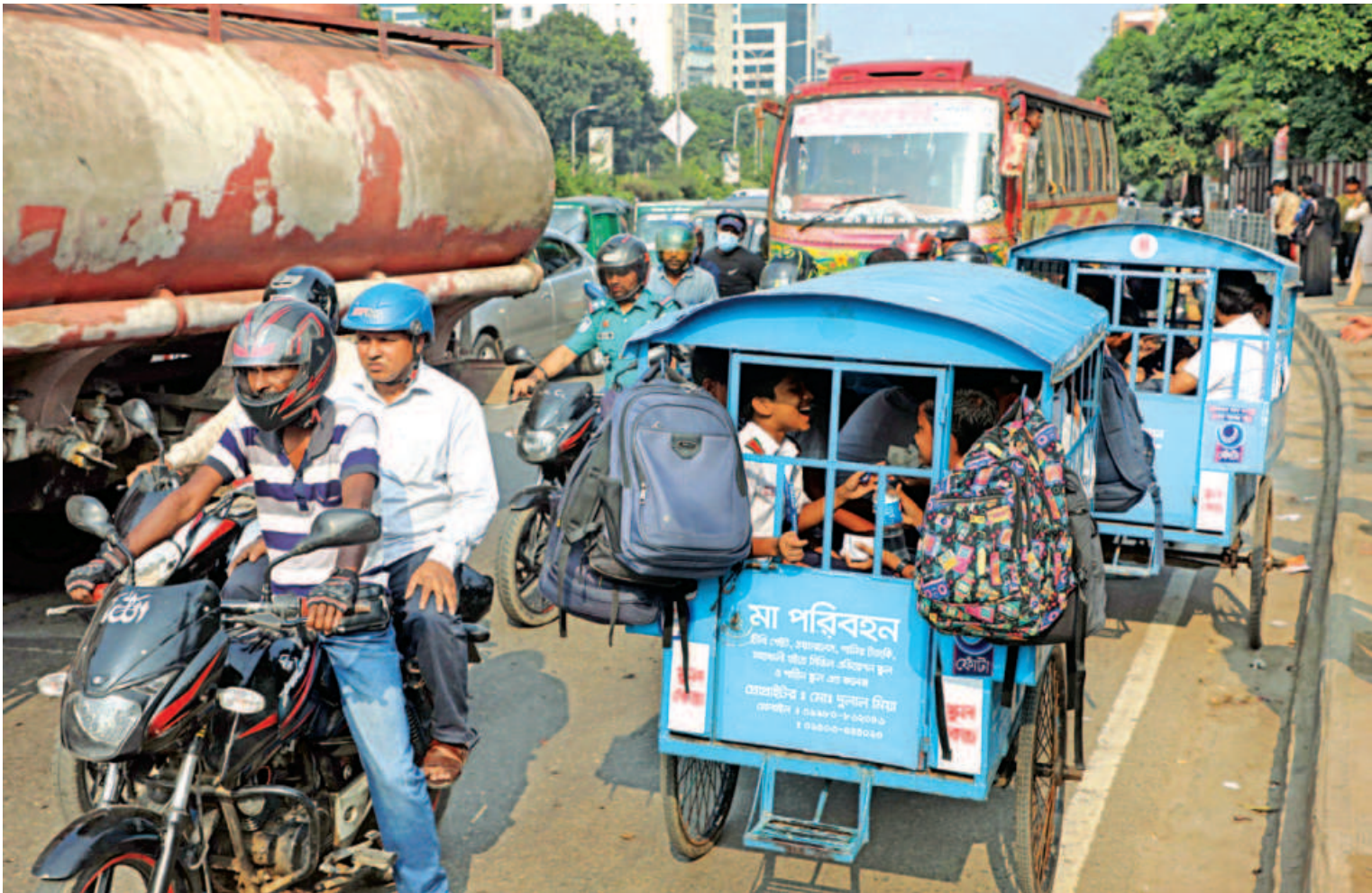
In order to avoid going all the way around Jahangir Gate, a school-van driver decides to take the wrong side just to save some time. Not only is this manoeuvre illegal and causing traffic congestion, it is also risky as the students can fall victim to accidents at any point. This photo was taken near Mohakhali flyover yesterday.