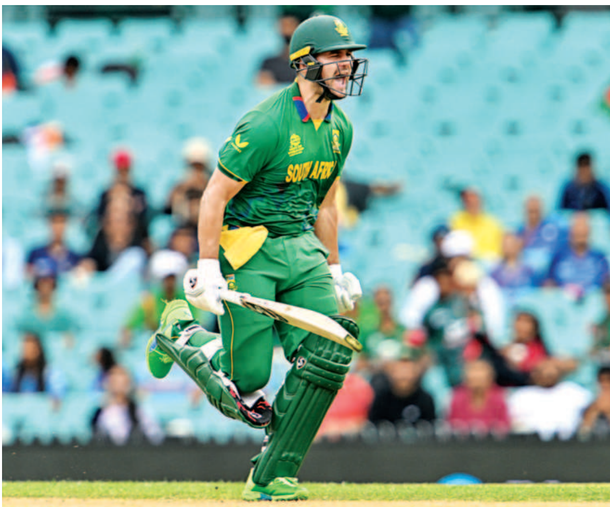
South Africa's Rilee Rossouw roars in jubilation as he became the first centurion of this edition of the T20 World Cup in Sydney on Thursday. The left-hander's 56-ball 109, his successive T20I ton, helped the Proteas register a thumping 104-run victory over Bangladesh in their Super 12 fixture.