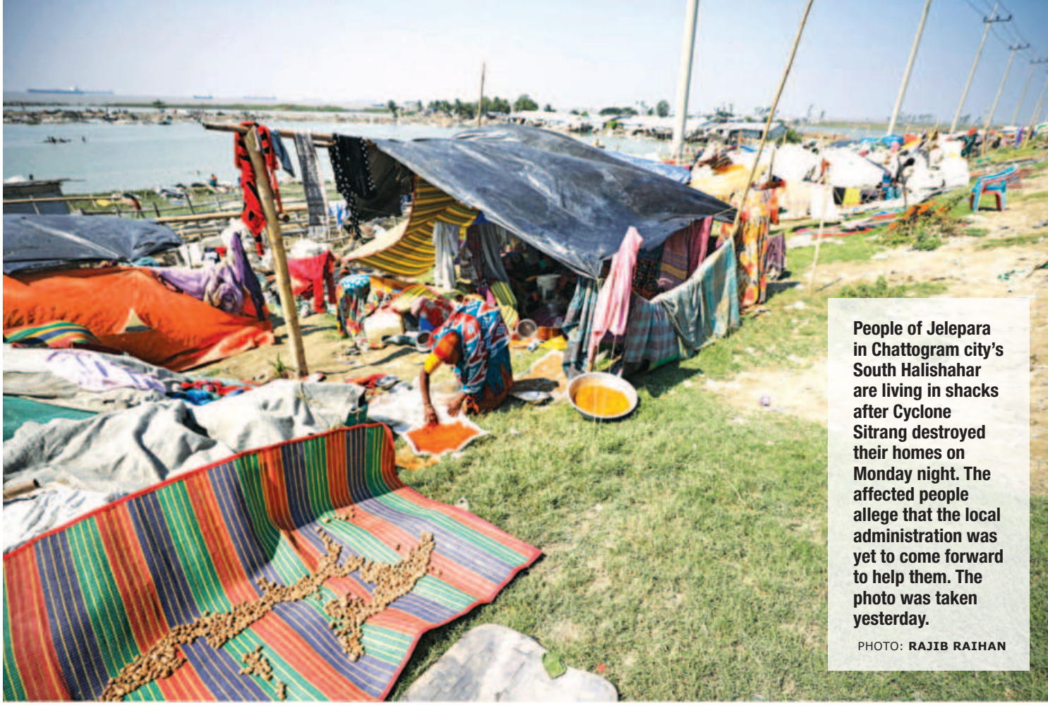
People of Jelepara in Chattogram city's South Halishahar are living in shacks after Cyclone Sitrang destroyed their homes on Monday night. The affected people allege that the local administration was yet to come forward to help them. The photo was taken yesterday.