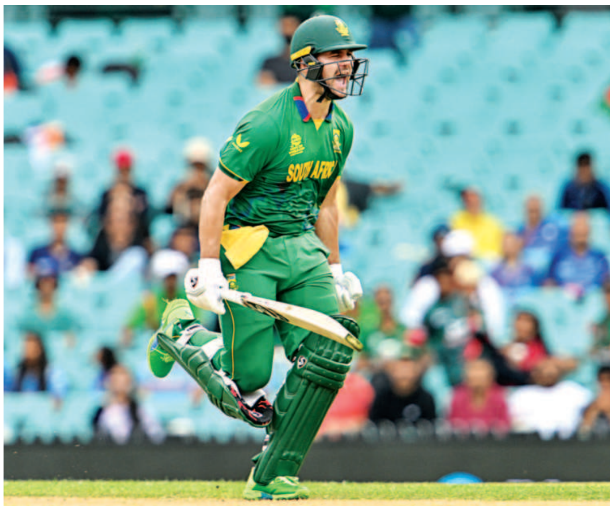
South Africa's Rilee Rossouw roars in jubilation as he became the first centurion of this edition of the T20 World Cup in Sydney on Thursday. The left-hander's 56-ball 109, his successive T20I ton, helped the Proteas register a thumping 104-run victory over Bangladesh in their Super 12 fixture.