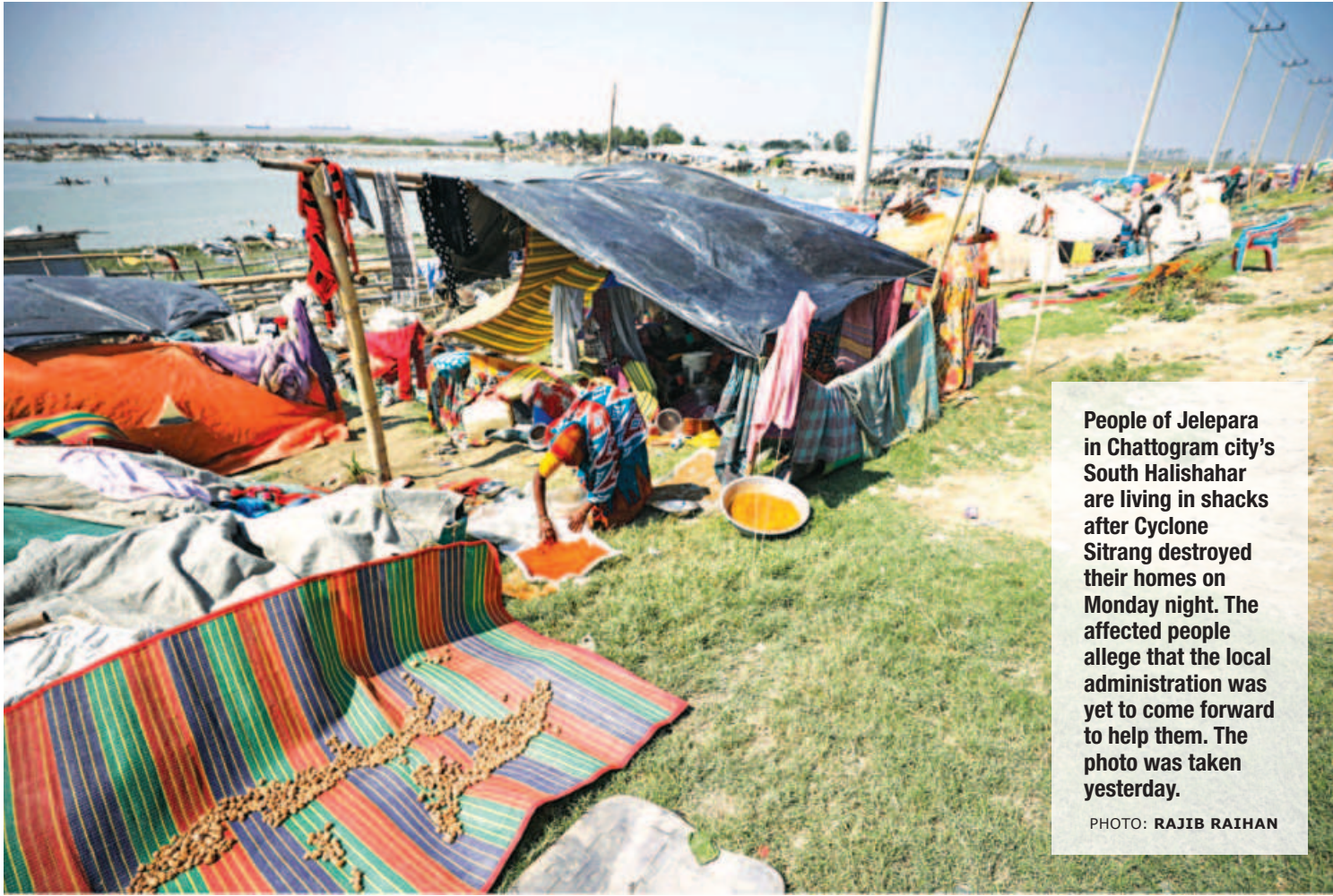
People of Jelepara in Chattogram city's South Halishahar are living in shacks after Cyclone Sitrang destroyed their homes on Monday night. The affected people allege that the local administration was yet to come forward to help them. The photo was taken yesterday.