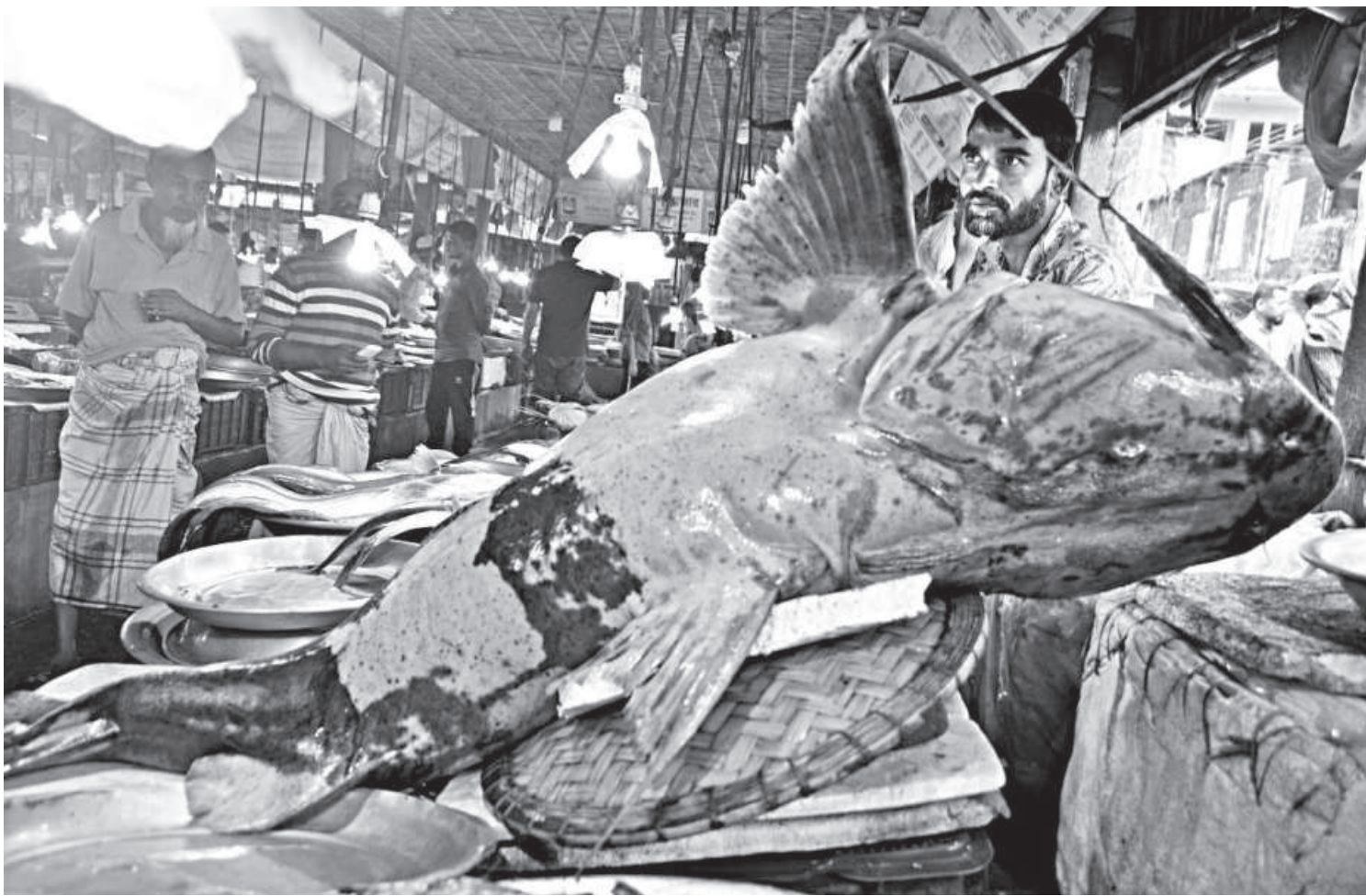
The critically endangered Gangetic goonch (Bagarius yarrelli), locally known as "Baghair" fish, is being displayed for sale at Lalbazar in Sylhet city. Even though buying and selling the fish is a punishable offence, due to lack of monitoring, it is being sold unabatedly. This photo was taken recently.