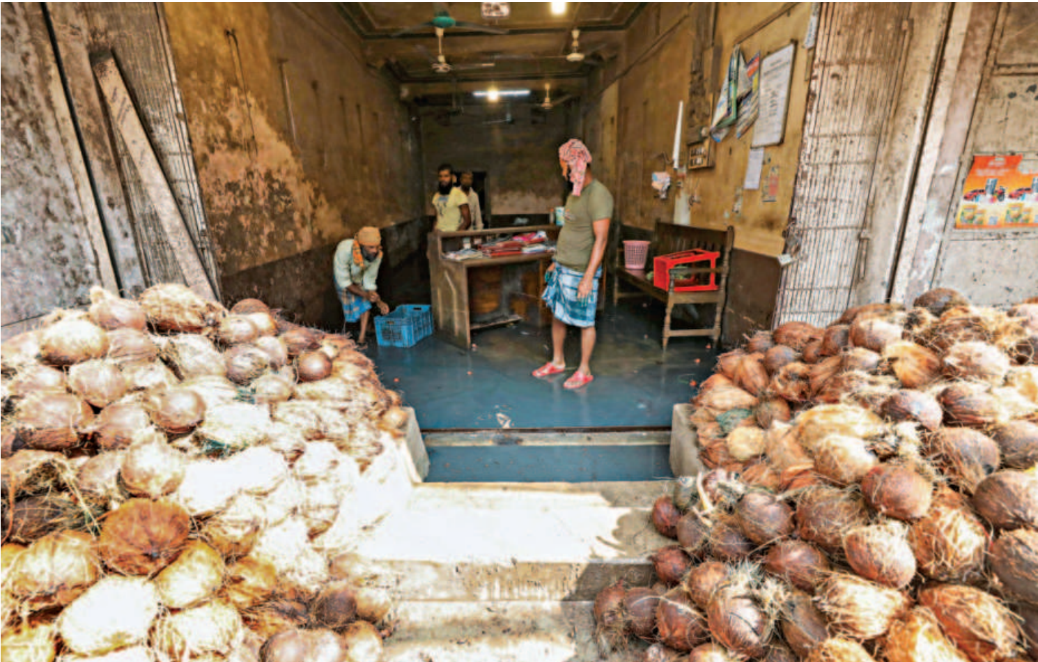
Workers are seen cleaning out a warehouse after the flood waters receded following a tidal surge caused by cyclone Sitrang in Khatunganj wholesale market in Chattogram on Monday. More than 5,000 warehouses are situated at the century old wholesale hub, where about 4,000 business are based.

"The traders never thought that water could enter the warehouses," he added.