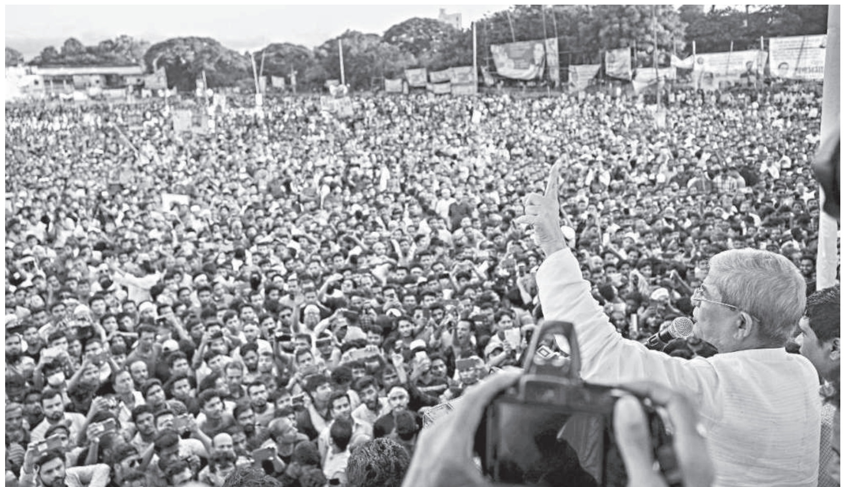
Despite obstacles, BNP's rally in Chattogram was attended by a huge number of supporters.

Previously, whenever they launched a movement, there was a common belief that central leaders would be resting in their drawing rooms while the party followers came out on the streets. This time, however, BNP's central leaders were out on the street to lead the protests, and it paid off through massive gatherings.