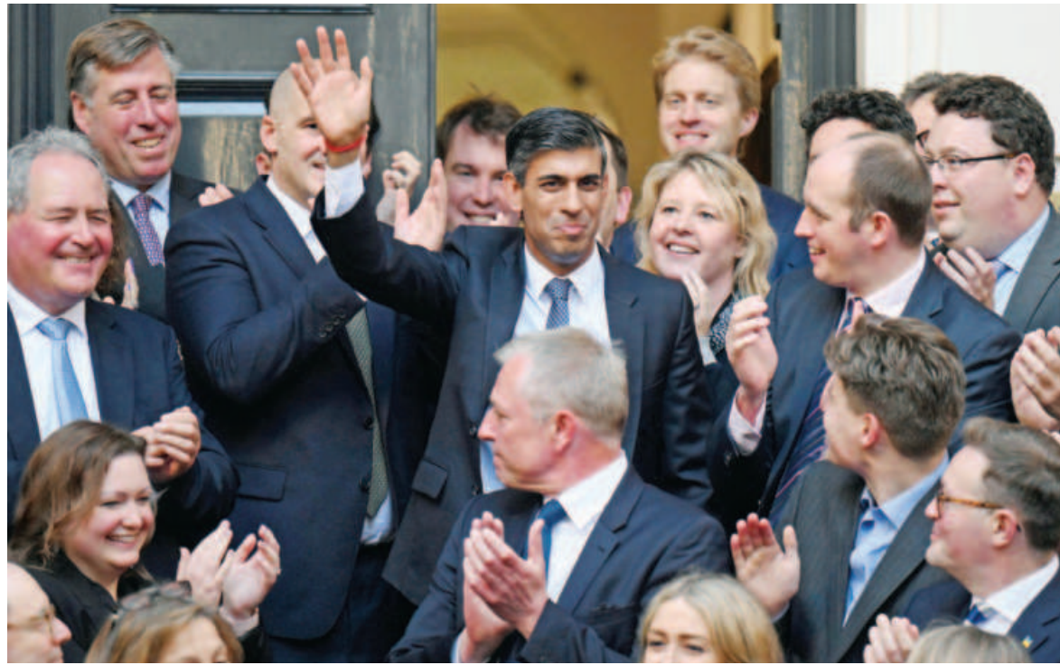
New Conservative Party leader and incoming UK prime minister Rishi Sunak (C) waves as he arrives at Conservative Party Headquarters in central London having been announced as the winner of the Conservative Party leadership contest, yesterday.

He was proved right as the budget sent the pound crashing to a record-low close to parity with the dollar and triggered yields on government bonds to soar.