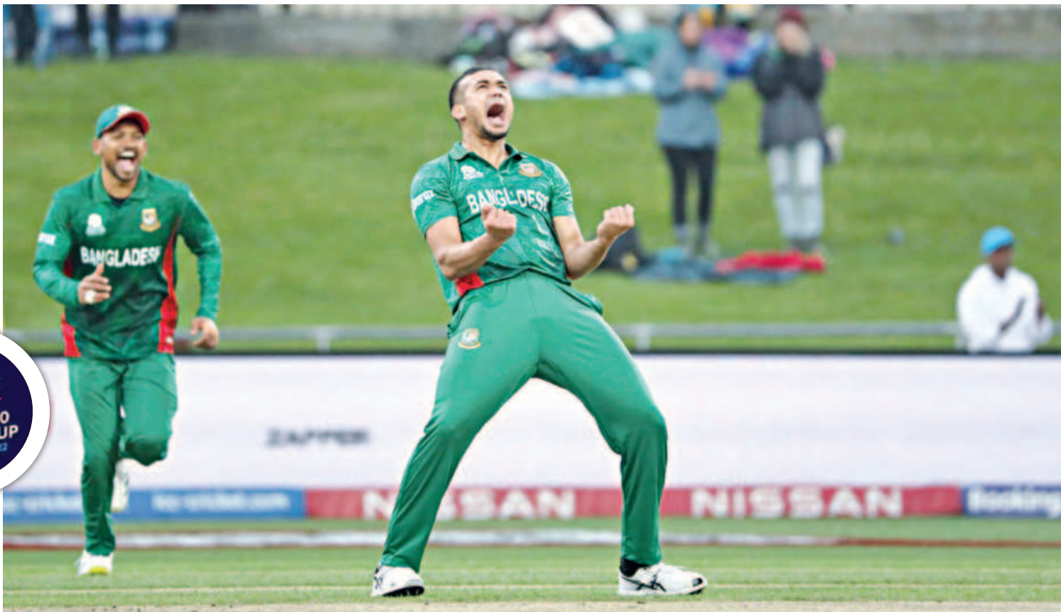
Bangladesh pacer Taskin Ahmed pumps his fists as Najmul Hossain Shanto runs in to join him in celebration following the dismissal of a Netherlands batter during their Super 12 fixture of the T20 World Cup at the Bellerive Oval in Hobart yesterday. Taskin took four wickets for 25 runs as Bangladesh won the match by nine runs.