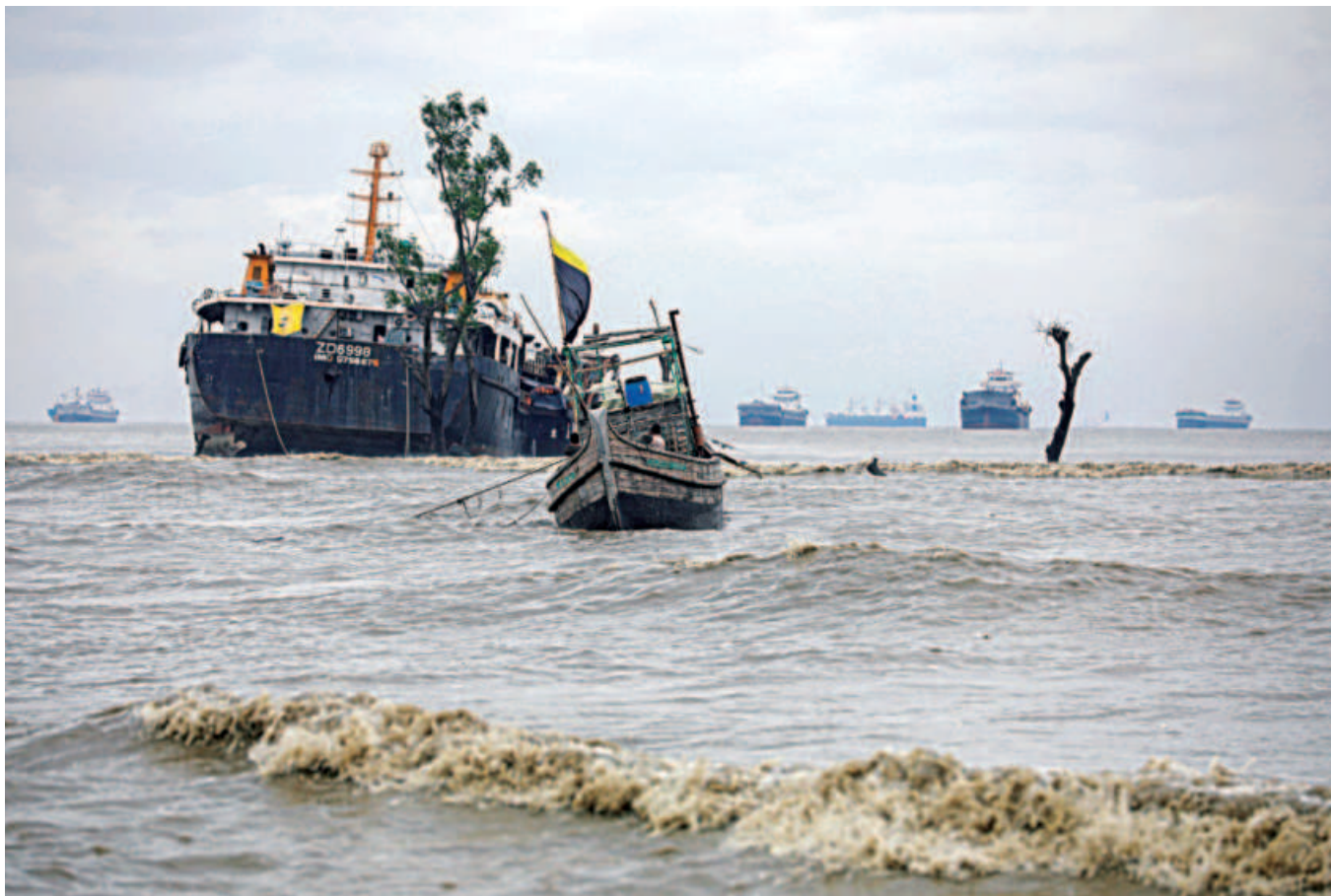
The Bay was rough all day yesterday as the country braced itself for Cyclone Sitrang, which started crossing the Bangladesh coast last night. The photo was taken in Chattergram city's Patenga area.