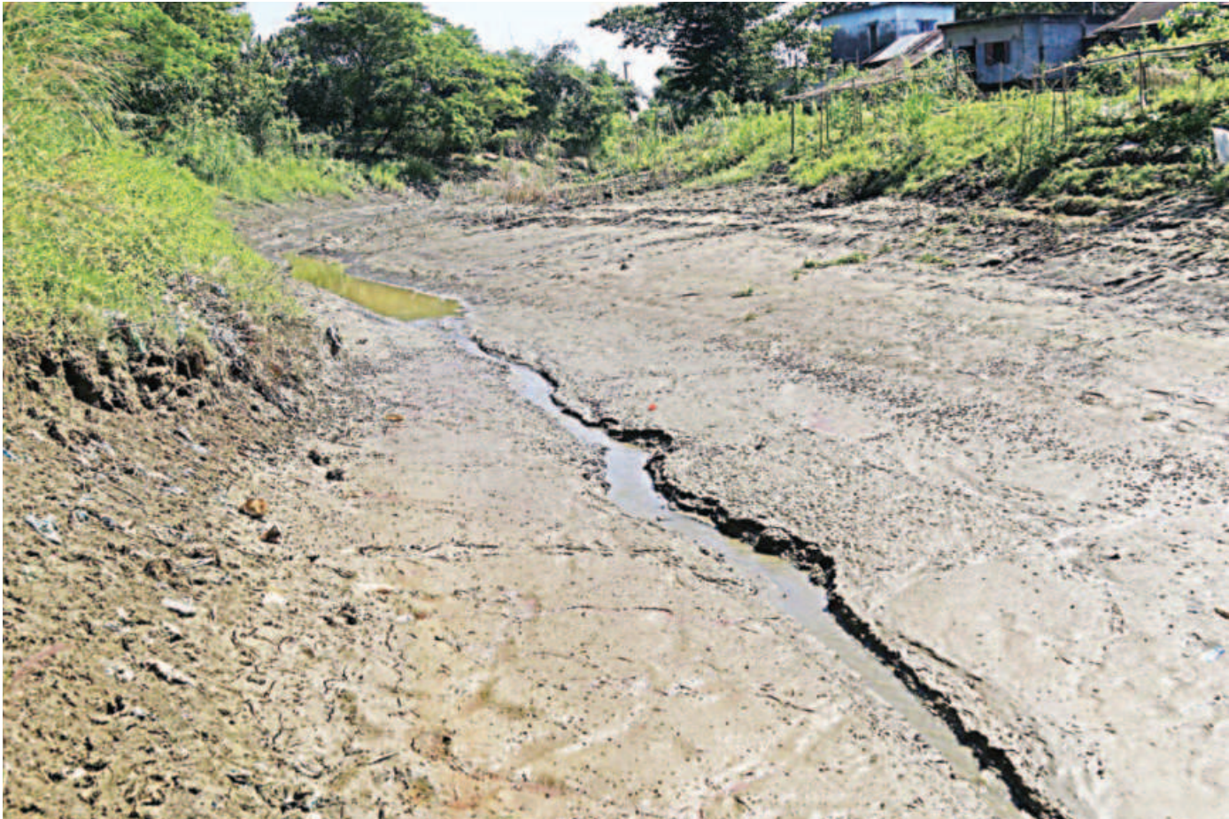
Once 200 feet wide, the Basia river, a branch of the Surma, does not even look like a stream now as the river has been encroached on at different points and not been dredged for long. Locals do not get irrigation water in the dry season. Their demand for dredging falls on deaf ears. The photo was taken at Masuganj Bazar in Sylhet Sadar upazila on Saturday.