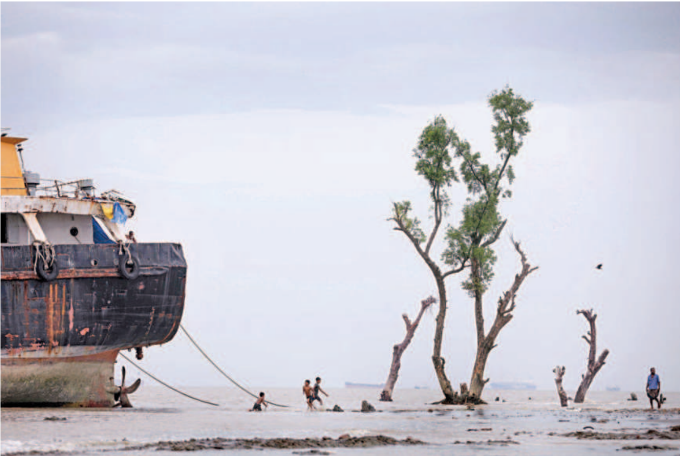
A LOOMING STORM ... There is not a speck of blue to be seen above the Bay of Bengal, as dark clouds threaten the havoc that could be unleashed in the form of Cyclone Sitrang. The cyclone is expected to make landfall in Bangladesh within the next 48 hours, and has residents in coastal areas worried about the destruction it could leave behind.