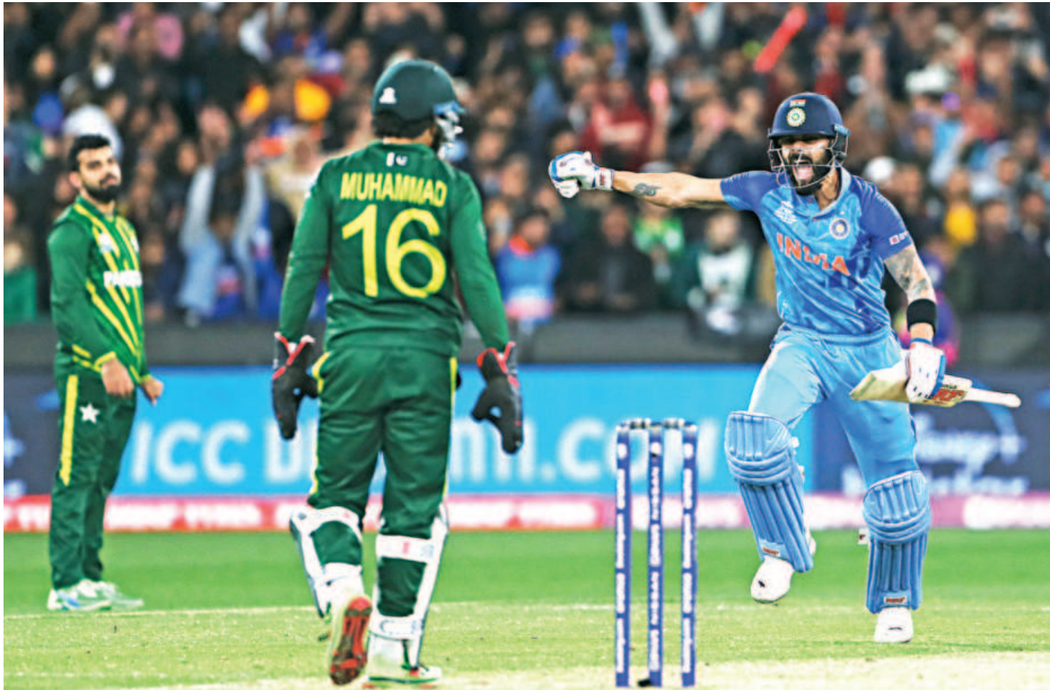
Virat Kohli pumps his fist and lets out a scream in joy following the winning run as Pakistan players look dejected at the end of their Twenty20 World Cup fixture at the Melbourne Cricket Ground yesterday. The former India skipper played an incredible, unbeaten knock of 82 runs off 53 deliveries as India snatched a thrilling win off the last ball of the game. "A treat to watch" on page 11.