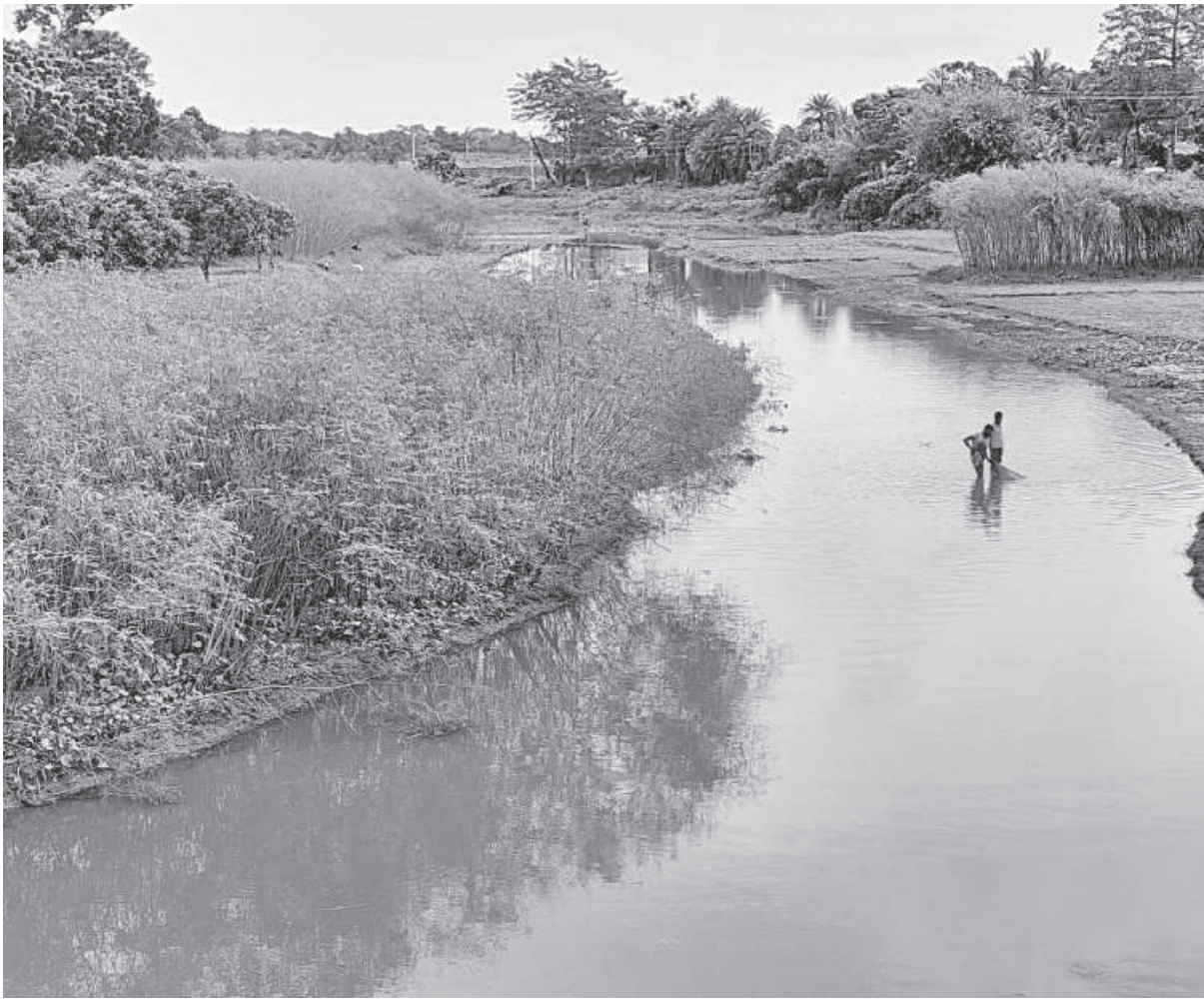
Due to rampant encroachment, the mighty Chitra river, flowing through the country’s southwestern districts, now looks like a narrow canal. Some people have excavated ponds, others have built concrete structures and created farmlands on both sides of the river in Jhenidah.

According to a government survey, the river was around 150-foot wide in Kaliganj.