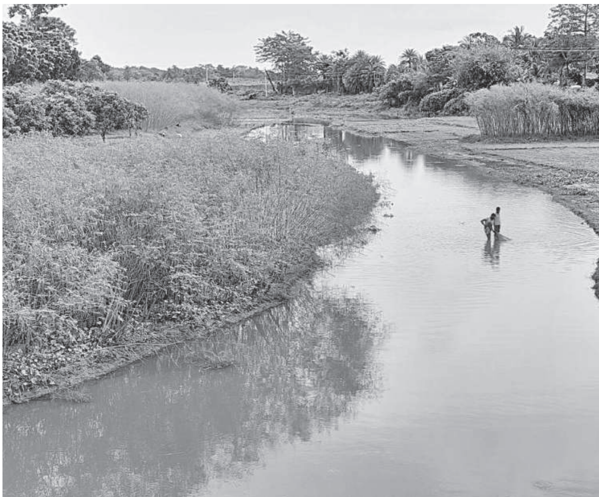
Due to rampant encroachment, the mighty Chitra river, flowing through the country's southwestern districts, now looks like a narrow canal. Some people have excavated ponds, others have built concrete structures and created farmlands on both sides of the river in Jhenidah.

According to a government survey, the river was around 150-foot wide in Kaliganj.