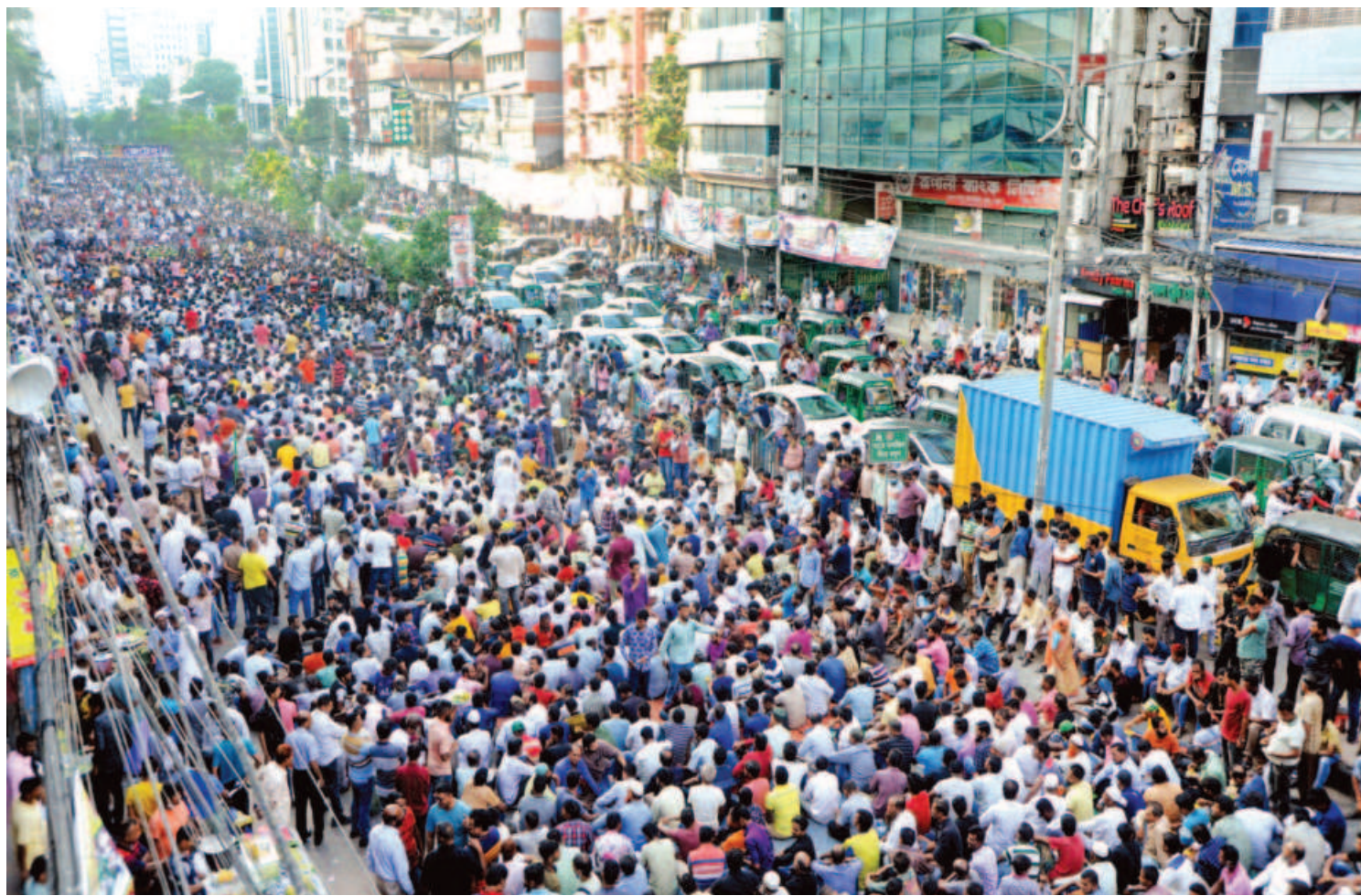
Hundreds of BNP supporters participate in a rally in front of the party's Nayapaltn headquarters in the capital yesterday. BNP's Dhaka south and north city units organised the event protesting the police attacks on party leaders and activists and their arrests and harassment in "false" cases.