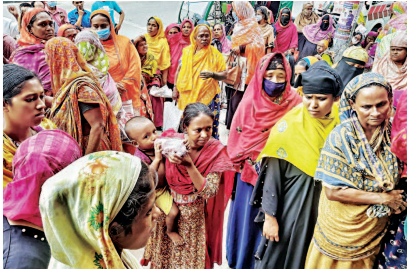
Women from low-income families waiting to buy rice and flour at subsidised rates from the government's food department at a district town. Experts have urged the authorities concerned to overhaul social safety net programmes in the country so that marginalised people from both rural and urban areas get equal opportunities.