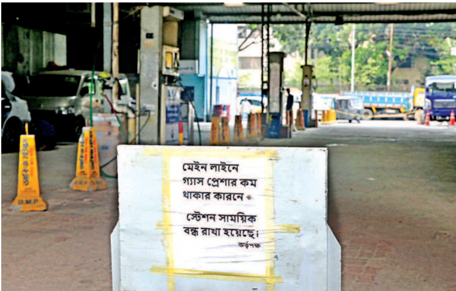
A sign informing motorists that a filling station is temporarily closed because of low gas pressure in the main line. Authorities of many filling stations in the capital are now keeping their CNG dispensers shut because the gas pressure dropped below the required level. The photo was taken in Tejgaon area yesterday.