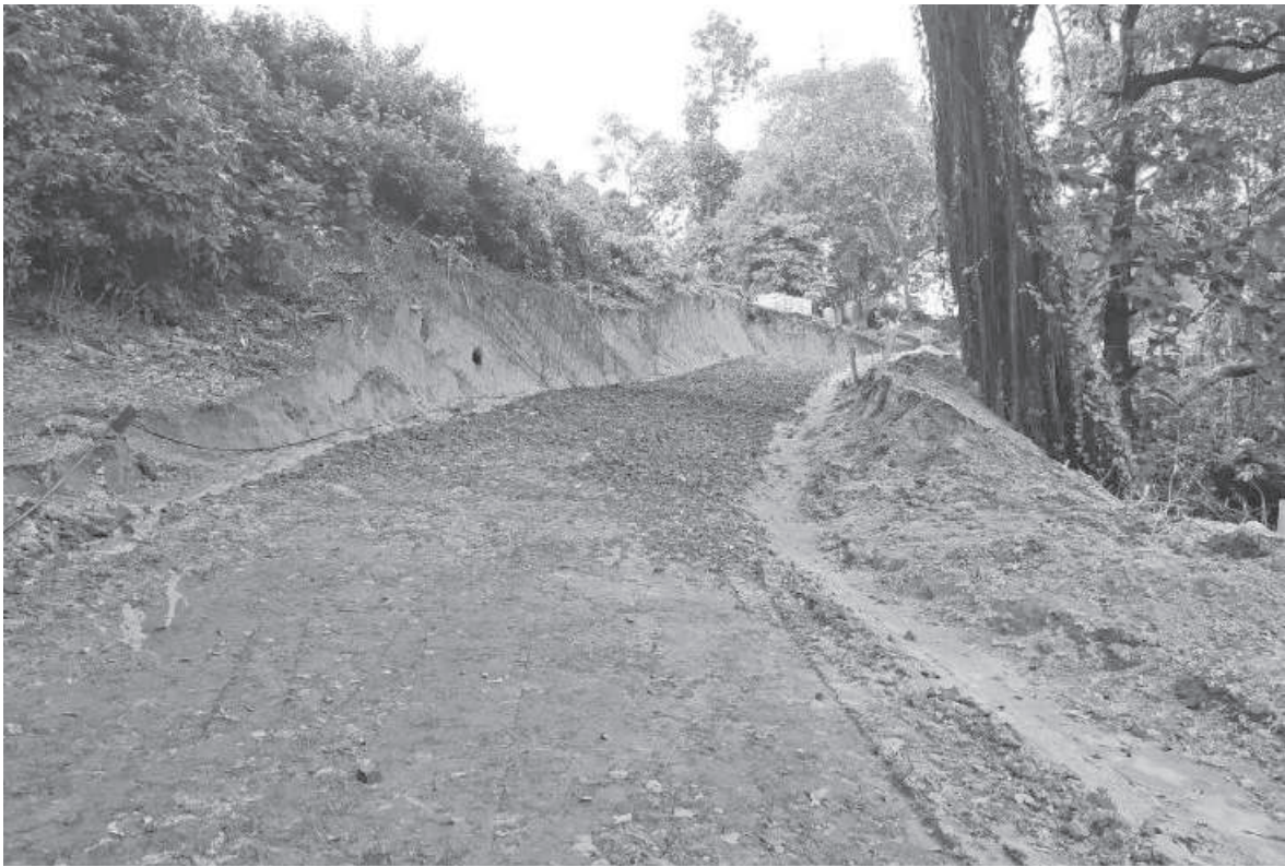
According to some locals, the group is building the new road, by cutting Joy Pahar in Sarson Road area, to make the nearby hills accessible. After that, it will flatten the hills to make housing plots.