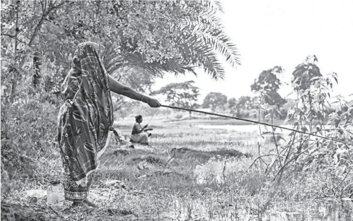
With a swift swing, a woman throws her bait, attached to her makeshift fishing rod, into Sajiara Khal, to catch small fish like puti. These women catch between one and two kilos of fish like this. After setting aside a portion for their own meals, they sell the rest for Tk 200 to 300. This photo was taken in Khulna's Dumuria upazila yesterday.