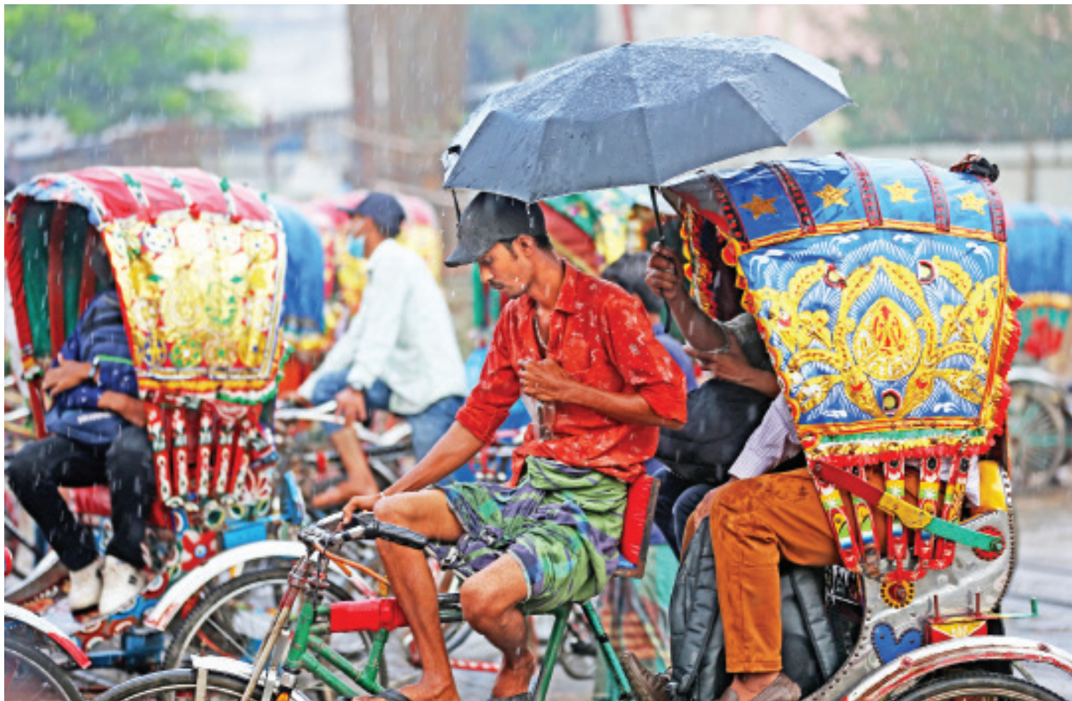
A passenger extends his umbrella to the rickshaw-puller after a sudden drizzle took over the city yesterday afternoon, to make sure he too stays dry while taking them to their destination. This photo was taken in Tejgaon area.