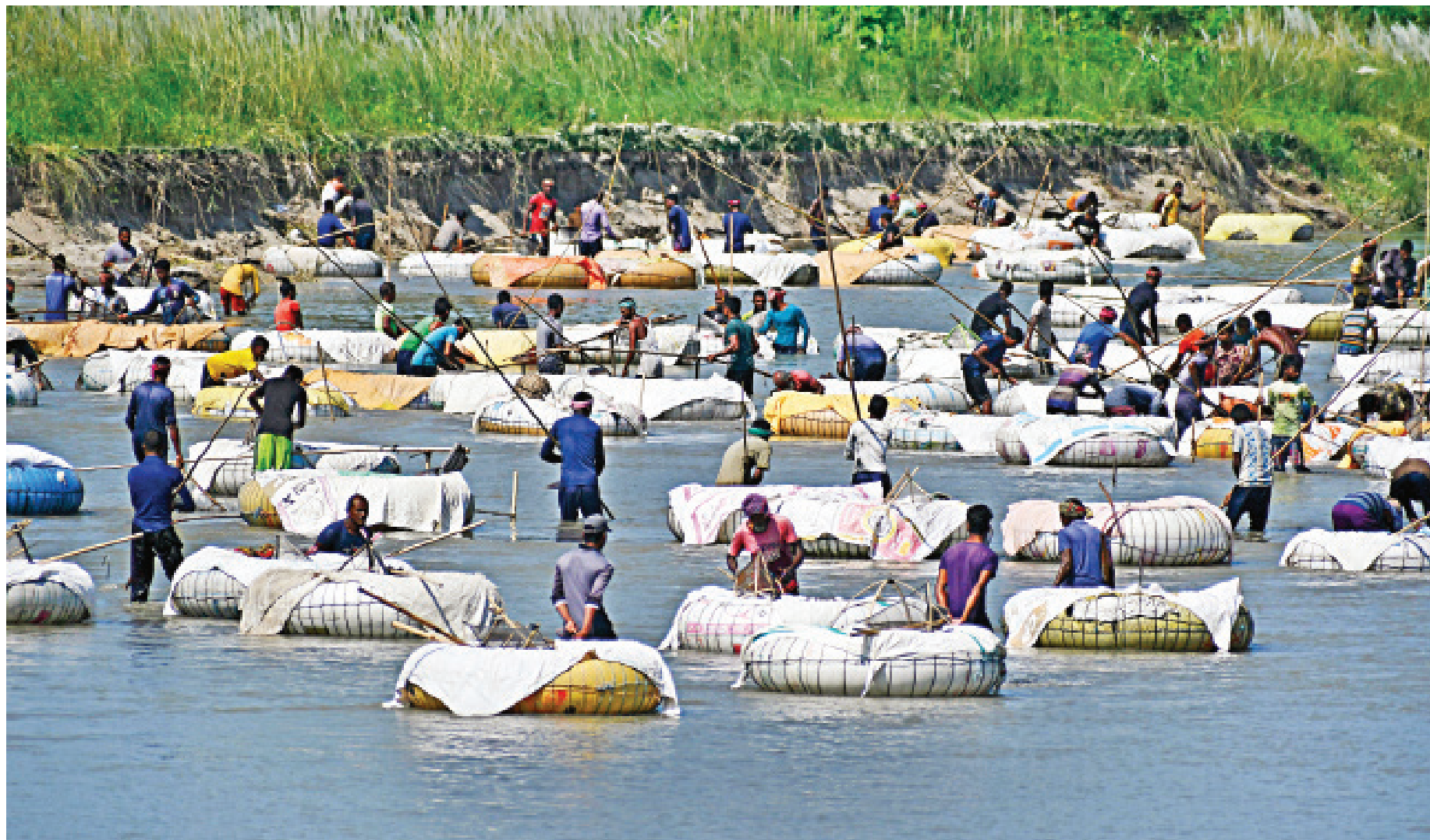
Workers collecting stones from the Mahananda river in Panchagarh's Tentulia upazila. One earns Tk 500-1,000 a day by selling these. The photo was taken in Dak Bungalow area yesterday.