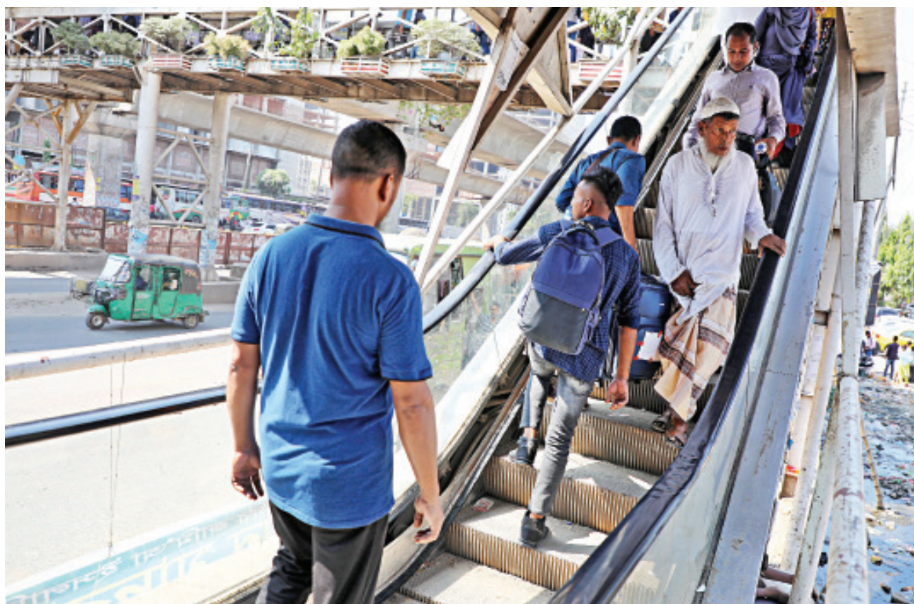
Even though there is an escalator for the footbridge near the Hazrat Shahjalal International Airport, people have to climb the stairs as it is broken. The photo was taken yesterday.