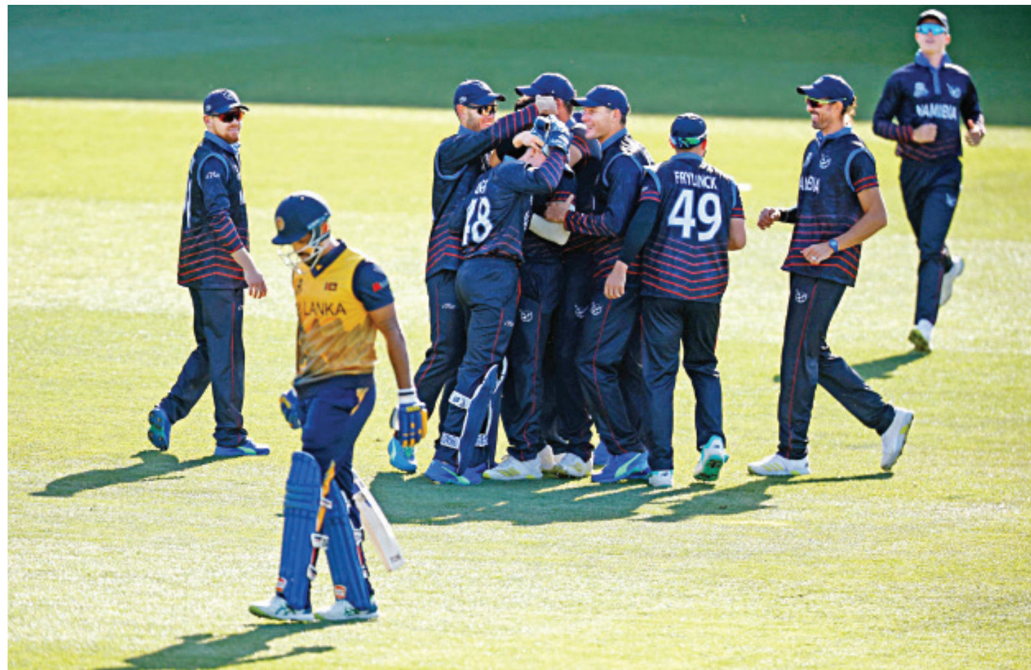
Namibia players celebrate the Sri Lanka skipper Dasun Shanaka's prized wicket during their 55-run win in the T20 World Cup opener in Geelong yesterday. Sri Lanka were bundled out for 108 after Namibia posted 163 for seven.