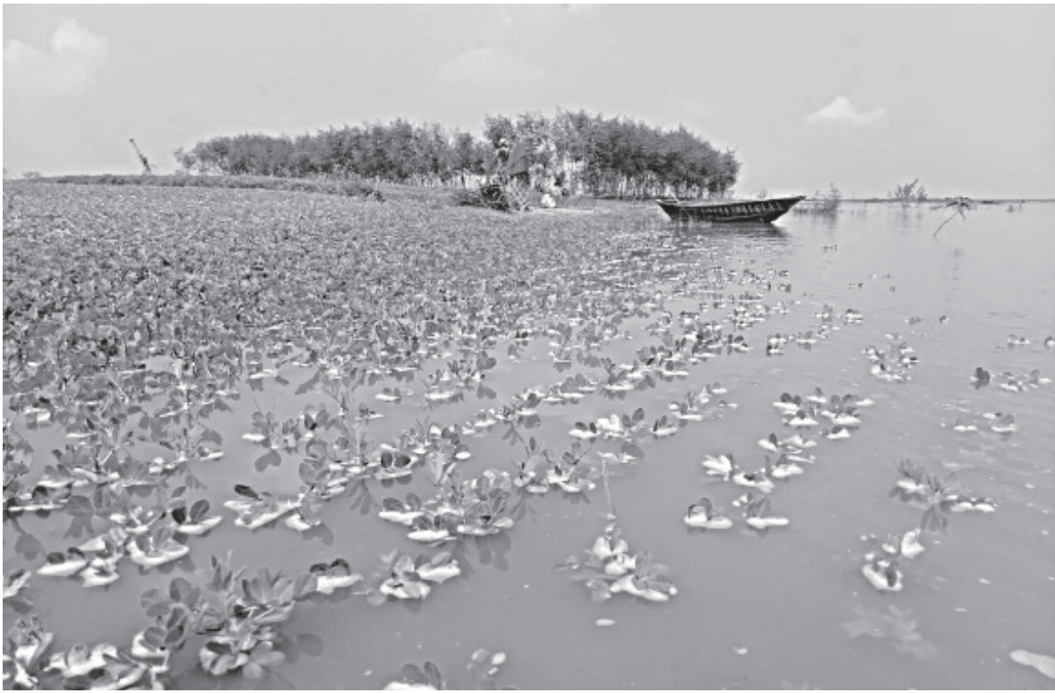
Crops of local farmers went under water as arable lands were washed away following the untimely rise of the Jamuna river's water in Tangail's Bhuapur.