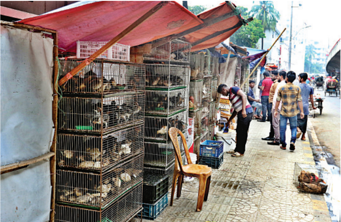
Traders selling pets and accessories on the footpath near the Anandabazar Veterinary Hospital in the capital yesterday. The Dhaka South City Corporation carried out an eviction drive in the area to clear footpaths of illegal traders a couple of months back, but it appears to have had little effect.