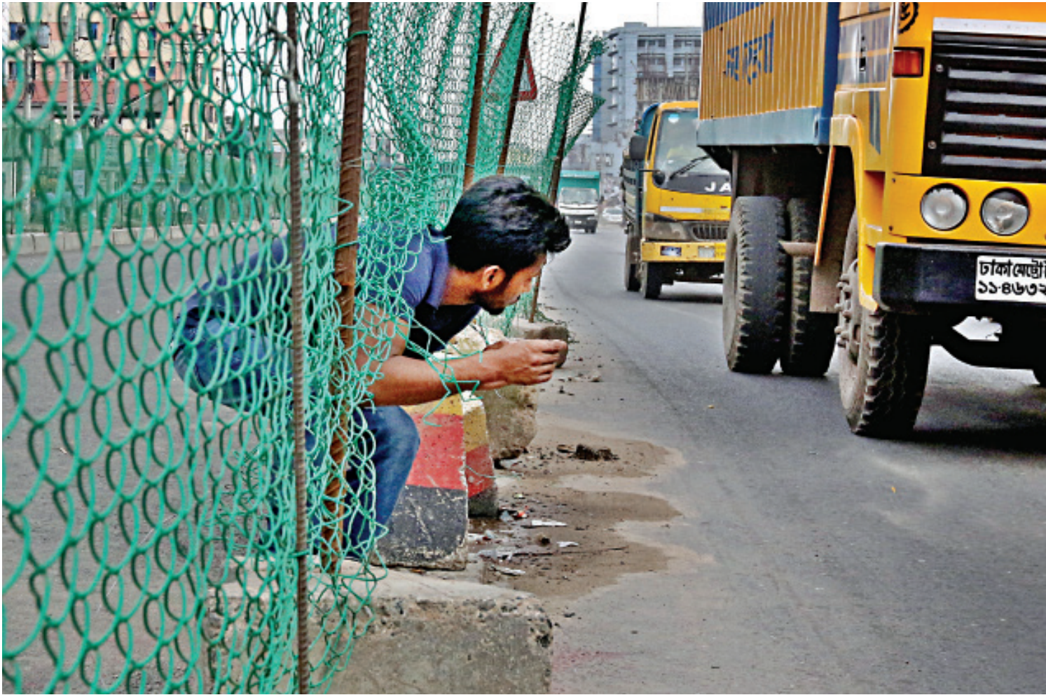
Bus Rapid Transit project authorities put up a fence as a road divider on Dhaka-Mymensingh highway for public safety and prevention of accidents. However, a man who seems to have no regard for his own safety is still attempting to cross the highway through a whole in the fence. The photo was taken in Kunia Targachh area of Gazipur.