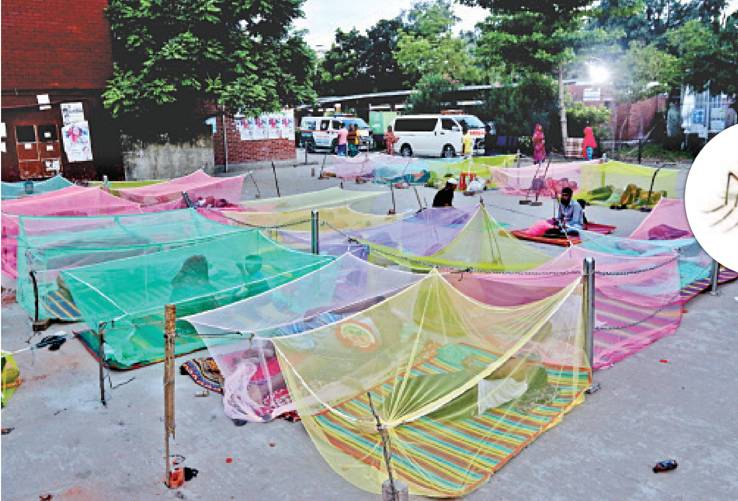
Parents of children admitted to Dhaka Shishu Hospital take the shelter of mosquito nets, set up by the establishment, to spend the nights there. As dengue overwhelms the country, people have become cautious about protecting themselves from the disease-carrying mosquitoes. This photo was taken at dawn on Wednesday.

UNB, Dhaka Prime Minister Sheikh Hasina yesterday asked the Bangladesh Army to serve the country with professional efficiency, dutifulness and integrity by remaining loyal to the leadership as well as being imbued with the spirit of the Liberation War and ideals of the Father of the Nation. The premier made the call while addressing the National Flag giving ceremony of the Headquarters' "71 Mechanised Brigade" "15 and 40 East Bengal (Mechanised)" as well as "9 and 11 Bangladesh Infantry Regiment (Mechanised)" at the CMP Centre and School SEE PAGE 4 COL 1