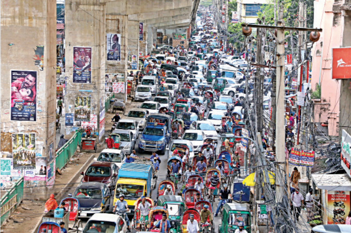
Vehicles continue to move at a snail's pace on this road from Bangla Motor to Moghbazar in the capital. The reason behind the gridlock is mainly due to parked cars, which occupy a part of the road. This photo was taken in front of Ispahani School yesterday.