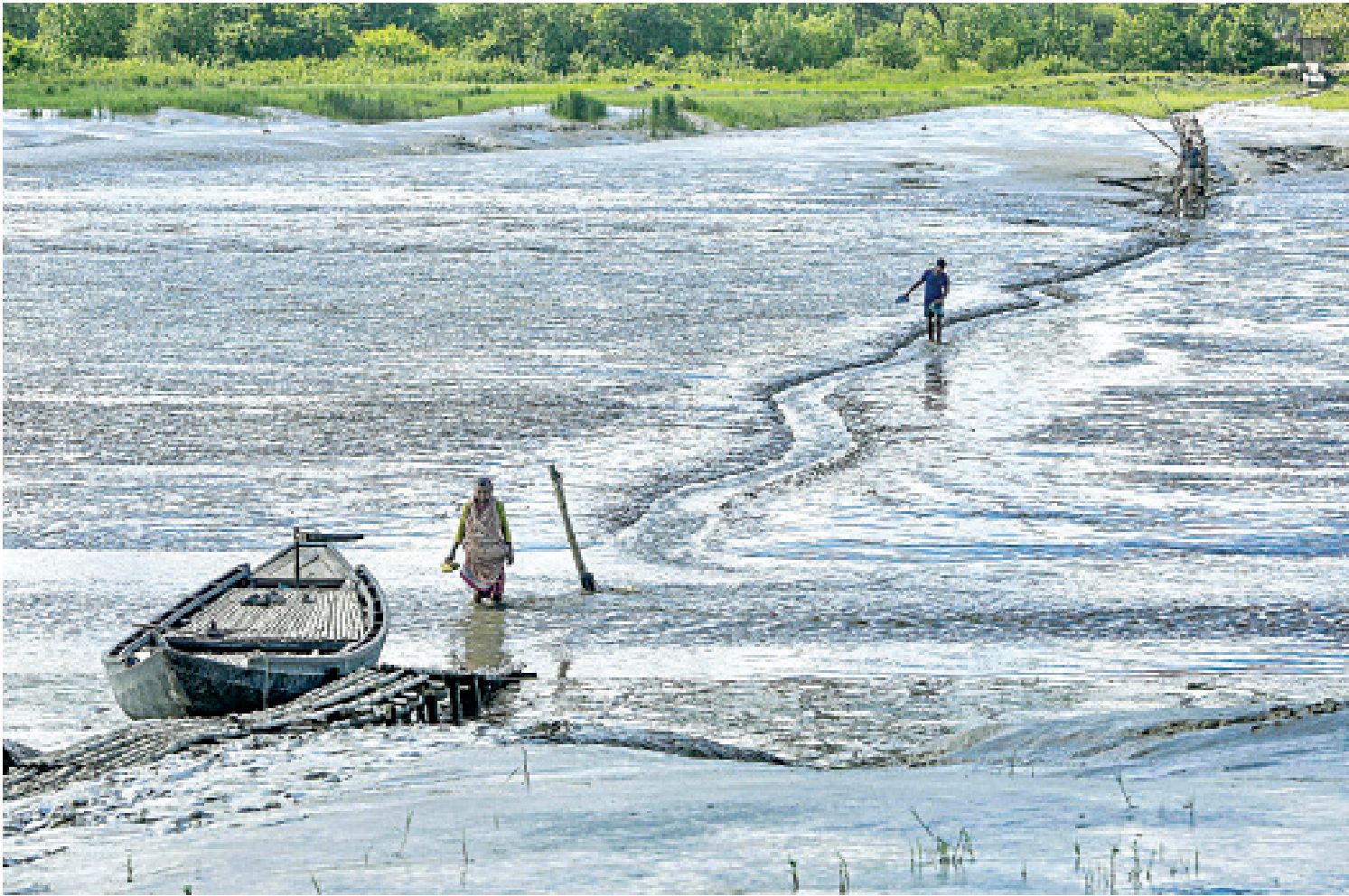
Locals in Khulna's Batiaghata upazila crossing the Shoalmari river on foot during low tide. They claimed that the river was around 150 metres wide and had strong current until the Rupsha Railway Bridge was constructed in the region. In recent time, the river reduced to a three to four-metre-wide stream.