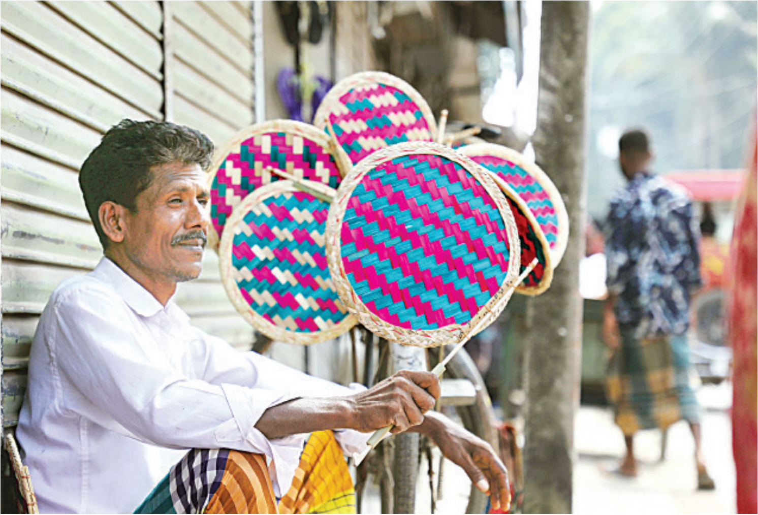
The demand for hand fans is rising as the situation of load-shedding is worsening amid hot and humid weather. Each of these fans was being sold at Tk 75. The photo was taken in Manikganj's Singair upazila yesterday.