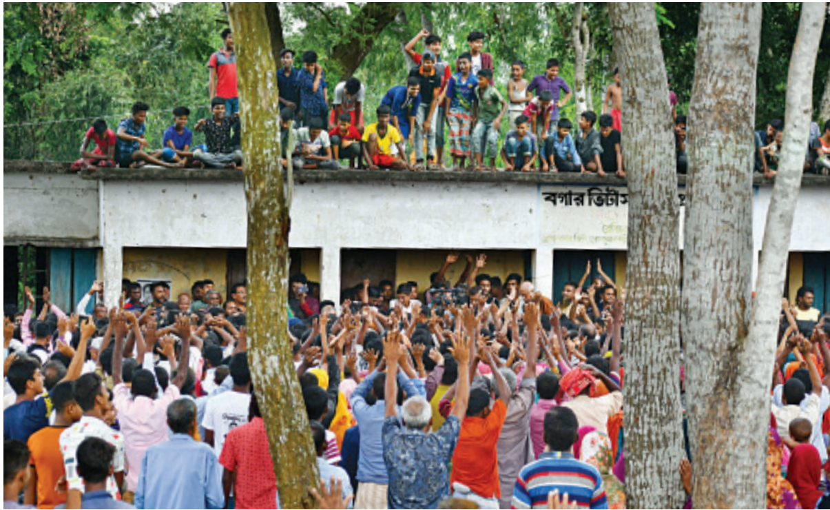
A big crowd gathered at the Bogarvita Government Primary School in Saghata upazila of Gaibandha yesterday, when the by-election to Gaibandha-5 was being held. All candidates other than the Awami League nominee called a press conference here to announce that they were boycotting the polls due to widespread irregularities during voting.