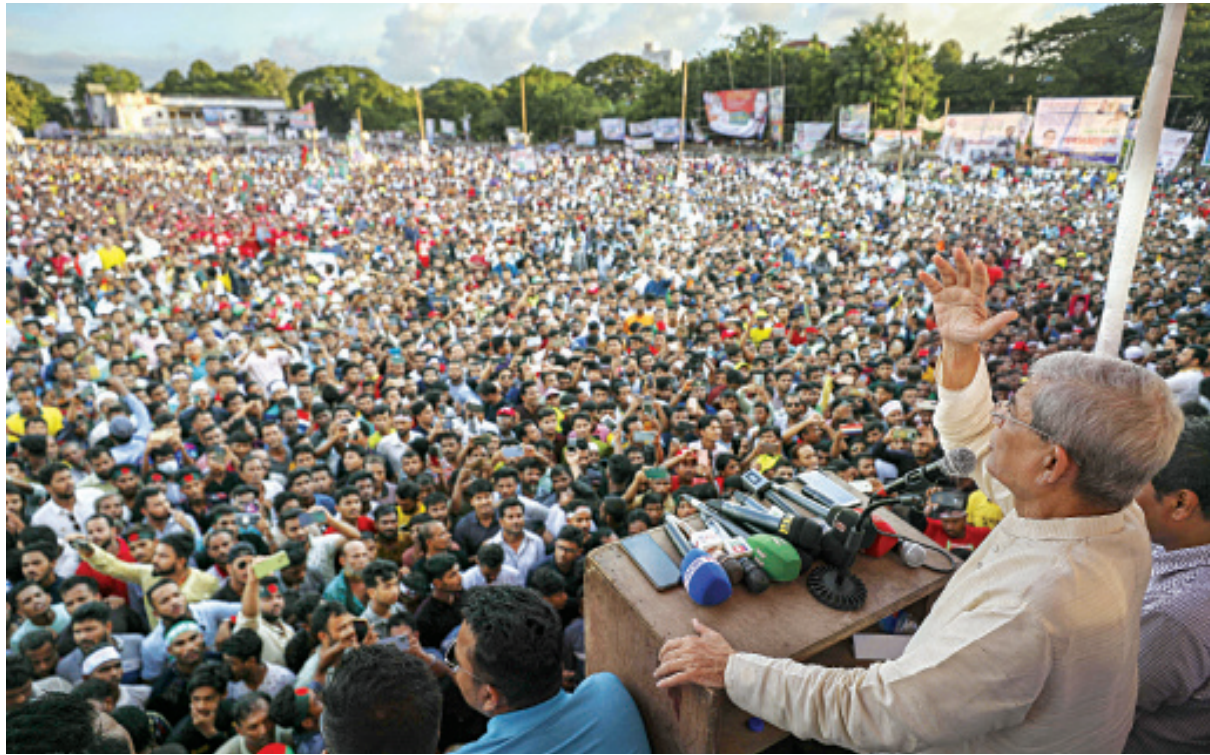
BNP Secretary General Mirza Fakhrul Islam Alamgir speaking in front of thousands of the party's supporters during a rally at Polo ground in Chattogram. The rally is the first of 10 that the party plans to hold in its different organisational divisions protesting the price hike of essentials and fuel oil, and the recent killings of five of its leaders and activists.