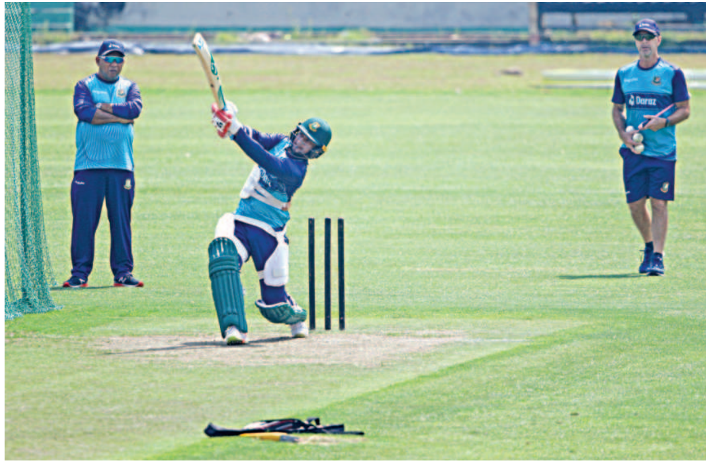
After missing the tournament opener due to delayed arrival, which raised many eyebrows, Bangladesh captain Shakib Al Hasan is all set to lead his side against hosts New Zealand in their second match of the tri-nation T20I series in Christchurch today. Can the ace all-rounder inspire the Tigers in making a turnaround following a dismal display against Pakistan?

A spot in the semifinals seems all but certain for the hosts but the main headache for this Bangladesh side would be when they might face another unfamiliar opponent at the latter stage of the tournament.