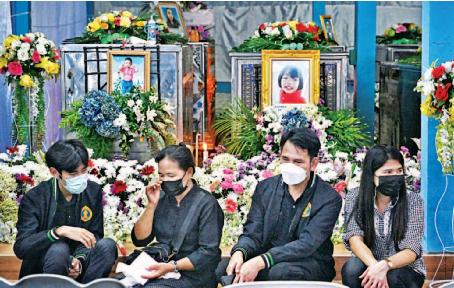
Relatives sit in front of the coffins of victims of the nursery mass shooting at Wat Si Uthai temple in Thailand's northeastern Nong Bua Lam Phu province yesterday, as relatives hold funeral rites for those killed in the massacre. Heartbroken families prayed for the victims of a Thai nursery massacre as the king offered his support, telling relatives he "shares their grief" in a rare public interaction with his subjects. An ex-policeman murdered 24 children and 12 adults on a three-hour gun and knife rampage in a rural area in Thailand on Thursday.

An aerial photograph taken after the explosion showed the petrol station building destroyed. Two two-storey residential buildings behind had collapsed.