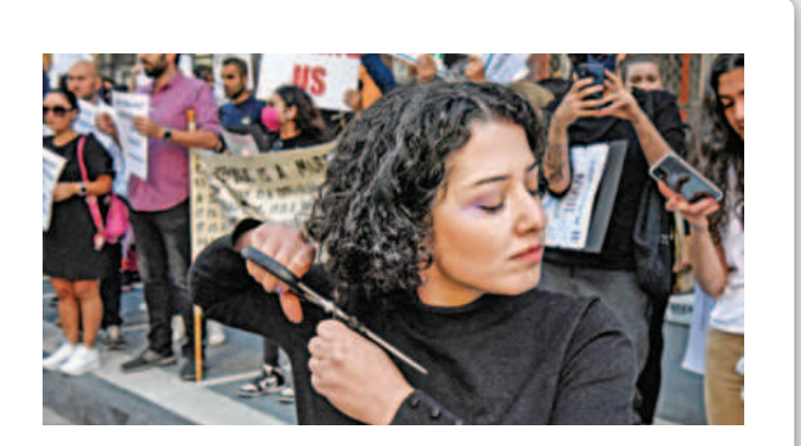
A woman cuts her hair during a protest against the Islamic regime of Iran in New York City, New York, US, September 27, 2022.

All these protests were brutally suppressed.