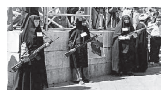
During the period from 1975 to 1980, the Chador or Burqa was used as a symbol of resistance against the Shah's regime.

Anglo-Iranian Oil Company, owned by Britain, enjoyed a monopoly on sale and production of Iranian oil. It was the most profitable British business in the world. In 1953, following the nationalization of the Iranian oil industry by the democratically elected prime minister Mohammad Mossadegh, American and British forces instituted a highly effective embargo of Iranian oil, and covertly destabilized the legislature and helped return control to their ally, Pahlavi. The American "Operation Ajax", orchestrated by the CIA, was aided by the British MI6 in organizing a military coup d'état to