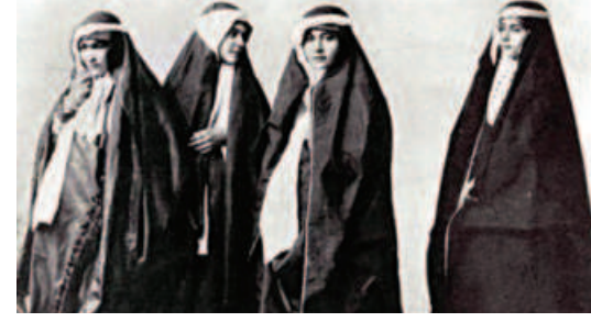
Iranian women with traditional chador veils before the hijab ban.

In the last few years before the Islamic Revolution of 1979, wearing headscarves became popular among those in the younger generation who often saw it as a means to express their political opposition to the monarchy and its westernisation of the Iranian society.