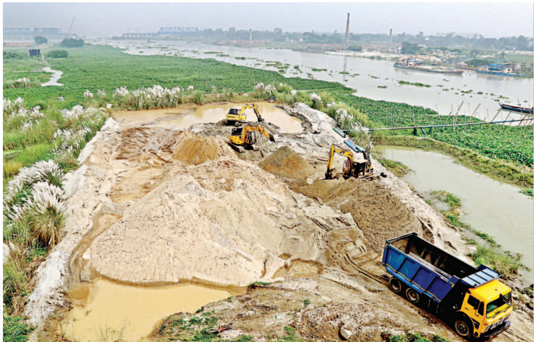
Excavators lifting sand piled up on the bank of the Dhaleshwari river in Munshiganj's Sirajdikhan upazila yesterday. The sand will be loaded onto trucks and taken away for construction work. Ships carry the sand from various regions and deposit it on the bank, resulting in this portion of the river becoming narrower over the years.

Monirul Islam, one of the passengers on the bus, claimed the accident occurred due to reckless driving.