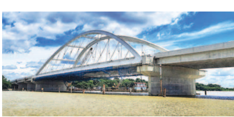
The Third Shitalakkhya Bridge over the Shitalakkhya in Narayanganj and the Madhumati Bridge, locally known as Kalna bridge, inset, over the Madhumati in Narail are scheduled to be opened to traffic by Prime Minister Sheikh Hasina on Monday. The Shitalakkhya Bridge will establish direct link between Narayanganj city and Bandar upazila, while the Madhumati Bridge will cut the distance between Dhaka and Jashore significantly.