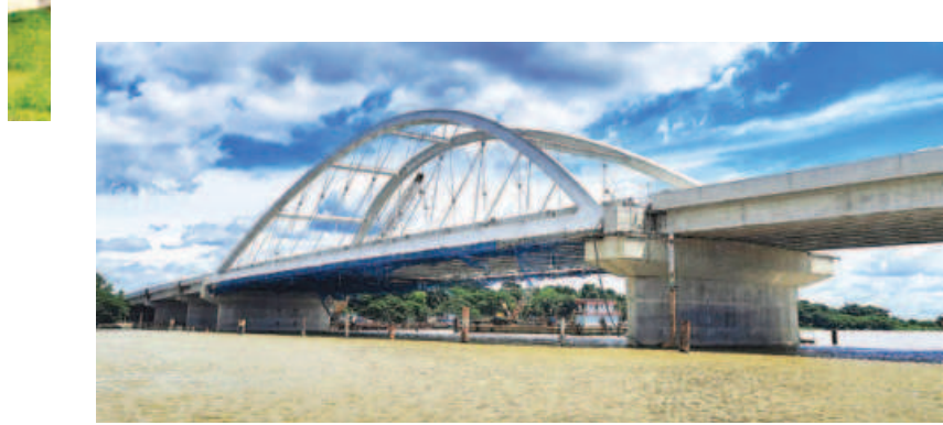
The Third Shitalakkhya Bridge over the Shitalakkhya in Narayanganj and the Madhumati Bridge, locally known as Kalna bridge, inset, over the Madhumati in Narail are scheduled to be opened to traffic by Prime Minister Sheikh Hasina on Monday. The Shitalakkhya Bridge will establish direct link between Narayanganj city and Bandar upazila, while the Madhumati Bridge will cut the distance between Dhaka and Jashore significantly.