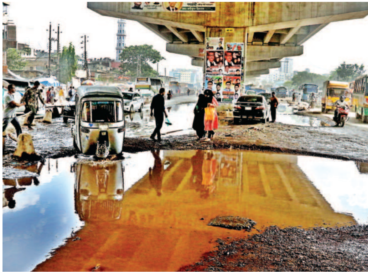
People carefully stepping around large pools of water beneath the BRT flyover in Gazipur. The rainwater gathers in the shallow areas created when the BRT was erecting pillars for the flyover, locals said. The poor state of the road also leads to congestion, as can be seen in the long queue of vehicles on the left. The photo was taken yesterday afternoon.