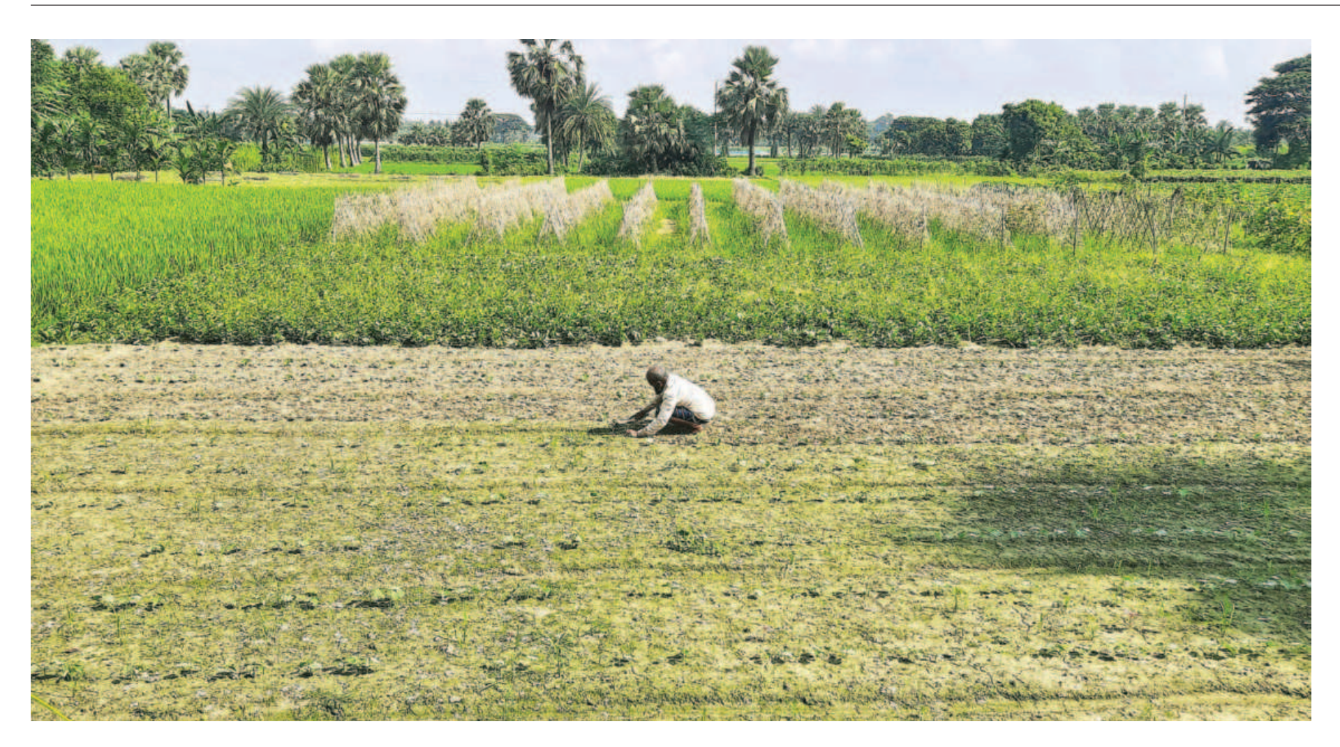
A farmer plants vegetable seeds for harvest in the winter. The photo was taken at Shannayashgachha village in Jashore's Keshobpur upazila on Tuesday. PHOTO: HABIBUR RAHMAN