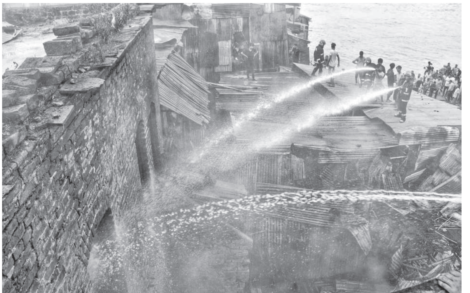
Firefighters trying to douse the blaze at Boro Bazar in Khulna Sadar upazila yesterday. At least 16 shops were gutted in the incident. Locals said the fire broke out at a shop there around 1:00pm and soon engulfed adjoining shops. The firefighters brought the situation under control in an hour. No casualties were reported as most shops were closed because of Durga Puja.