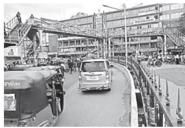
narrowed down the road."

Md Rafiqul Islam, a pedestrian at Bandarbar, said, "What is the point of using the overbridge when I can cross the narrow road in a few seconds? Besides, there's always gridlock as this structure has further