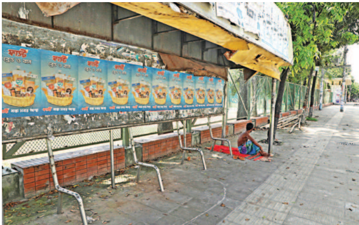
A bus stop has the rod beams in place for benches to be set, but the seating arrangement is conspicuously absent, compelling passengers to stand as they wait for buses. The photo was taken from the capital's Kalabagan area yesterday.