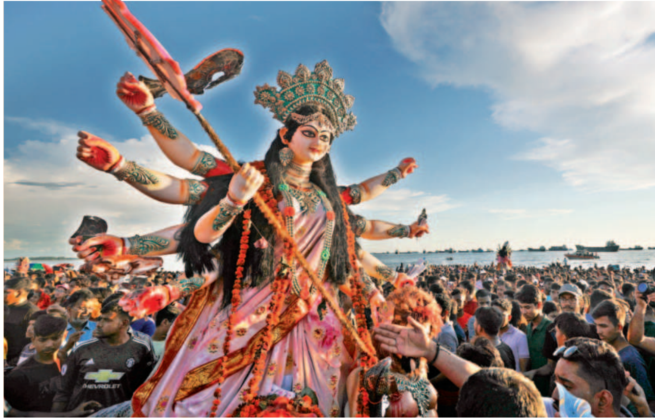
The idol of Durga surrounded by devotees on Bijoya Dashami at Chattogram's Patenga beach yesterday. All across the country, worshippers immersed idols of the goddess, signalling the end of Durga Puja, the biggest Hindu festival.