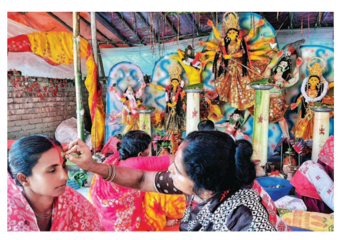
A group of women took charge of organising this year's Durga Puja at "Gachhtala Mandap" at Khalshibulia village in Khulna's Batiaghata upazila yesterday. Usually, the men of the community take the responsibilities of the festival.

Rights groups voiced deep concern after Iranian riot police used tear gas and paintball guns against hundreds of students at Tehran's Sharif University of Technology SEE PAGE 6 COL 4