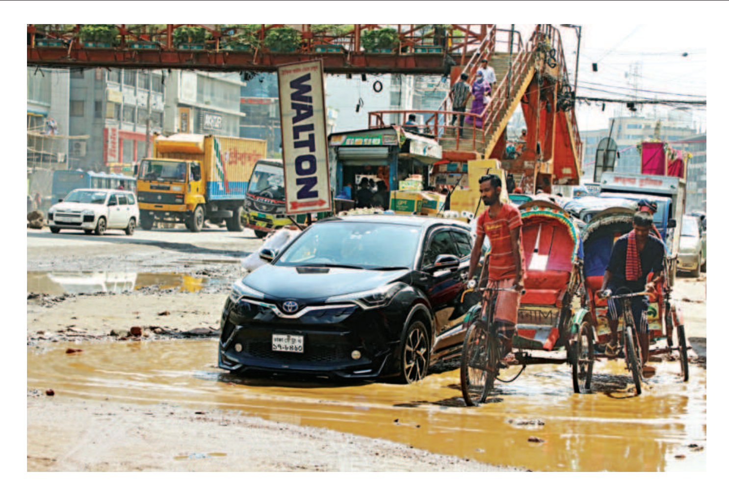
Massive potholes causing frequent traffic gridlocks and damaging vehicles in the capital's Uttara. According to locals, this pothole was detected around two months ago, but the authorities never paid any heed to repair it. The photo was taken near Rajlokkhi Complex yesterday.