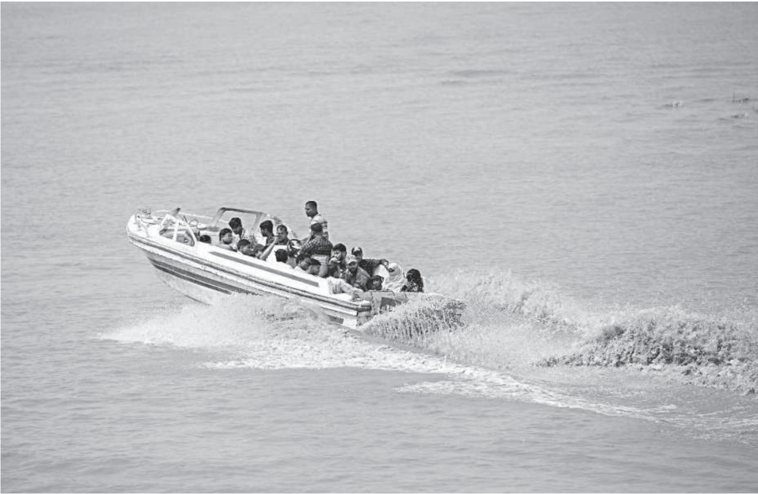
On April 20, a speedboat capsized in the Bay on the Kumira Guptachara route, unable to fight the strong gush of wind. After much protest from locals, the service was finally stopped. But just a few days later, speedboats started plying the route again with no life jackets on passengers, as if nothing ever happened. This photo was taken in Sitakunda yesterday.