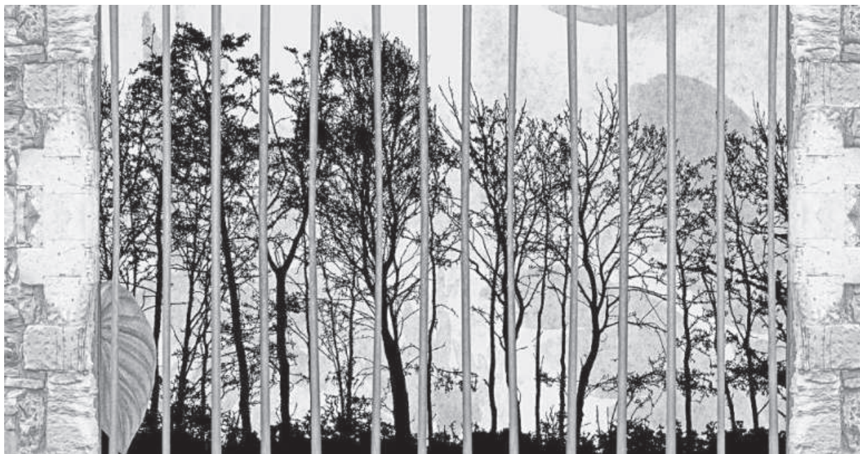
How do we save our forests when the agencies that are supposed to protect them do the opposite? VISUAL: STAR