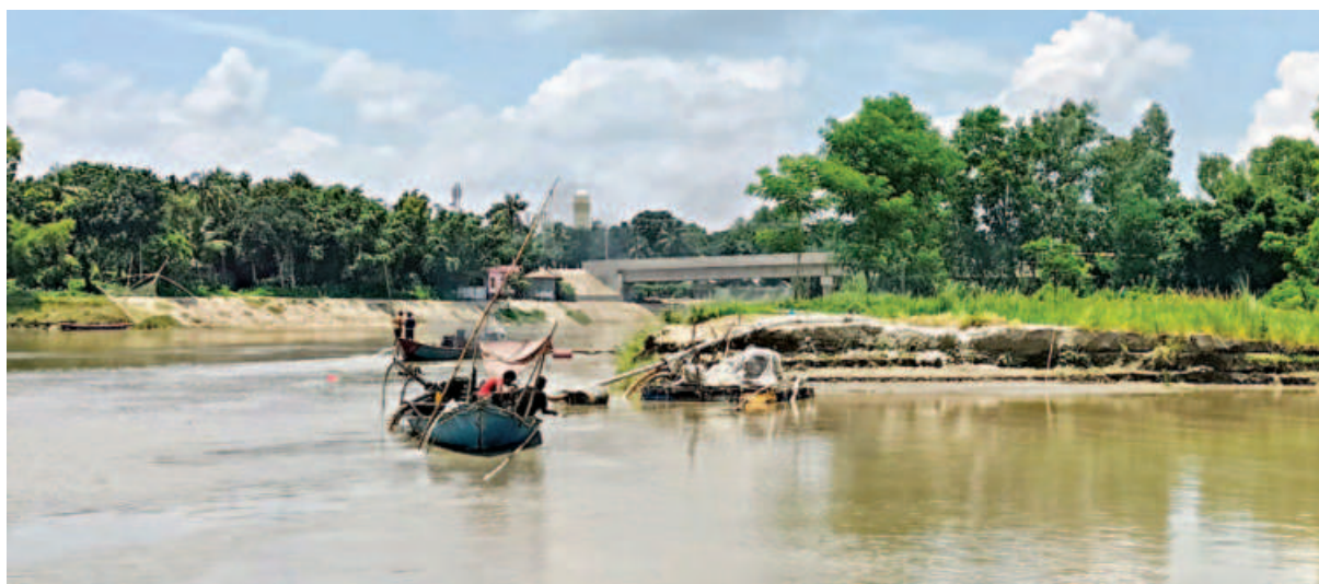
Illegal sand lifting from the Kaliganga river adds to the problem of river erosion at different villages in Manikganj's Daulatpur upazila.