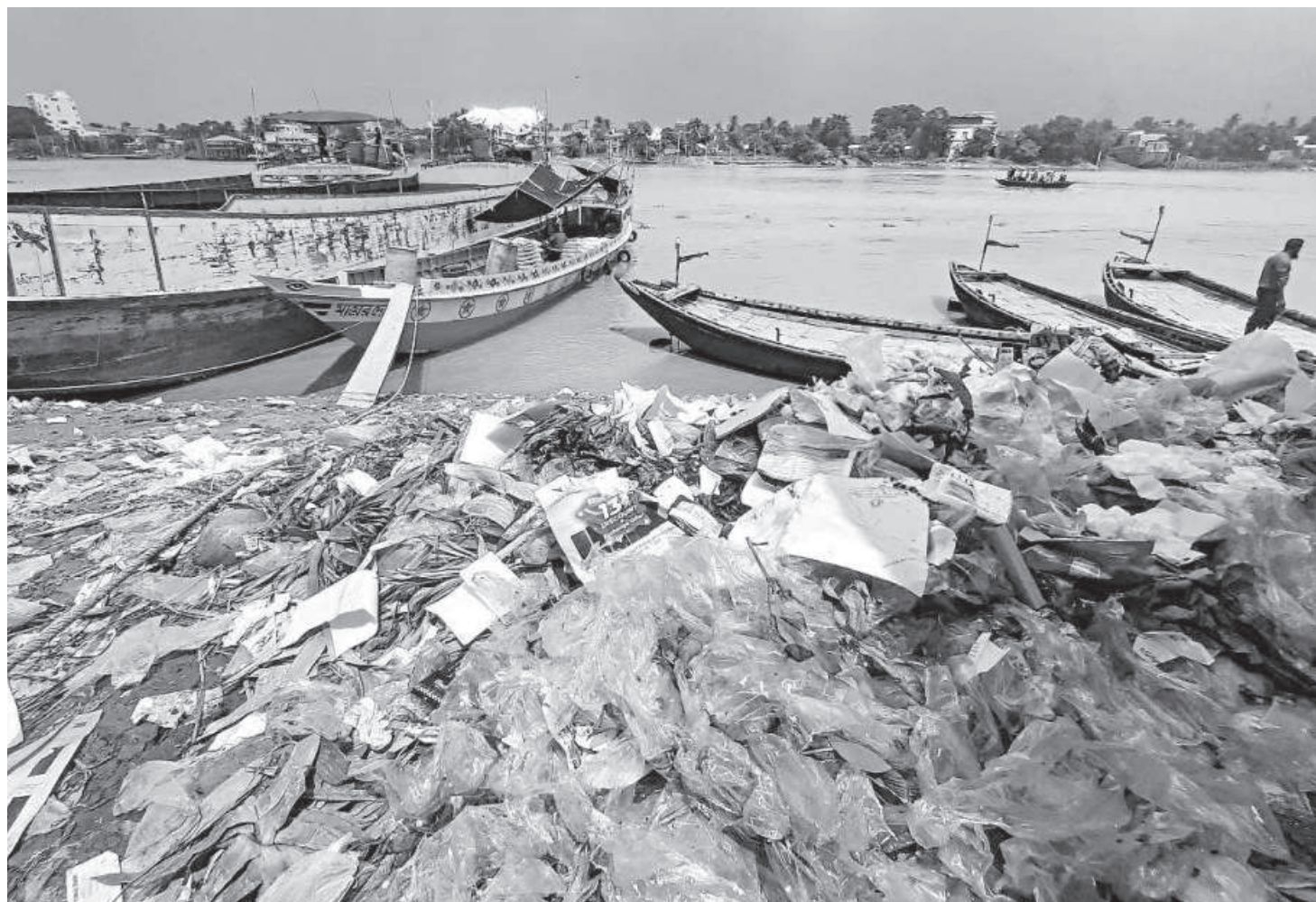
Plastic and organic waste continues to infiltrate the Bhairab river banks. When the river swells, much of it gets carried into the waterbody. As a result, the river keeps getting polluted. This photo was taken in Kalibari Kheyaghat in Khulna's Borobazar area recently.