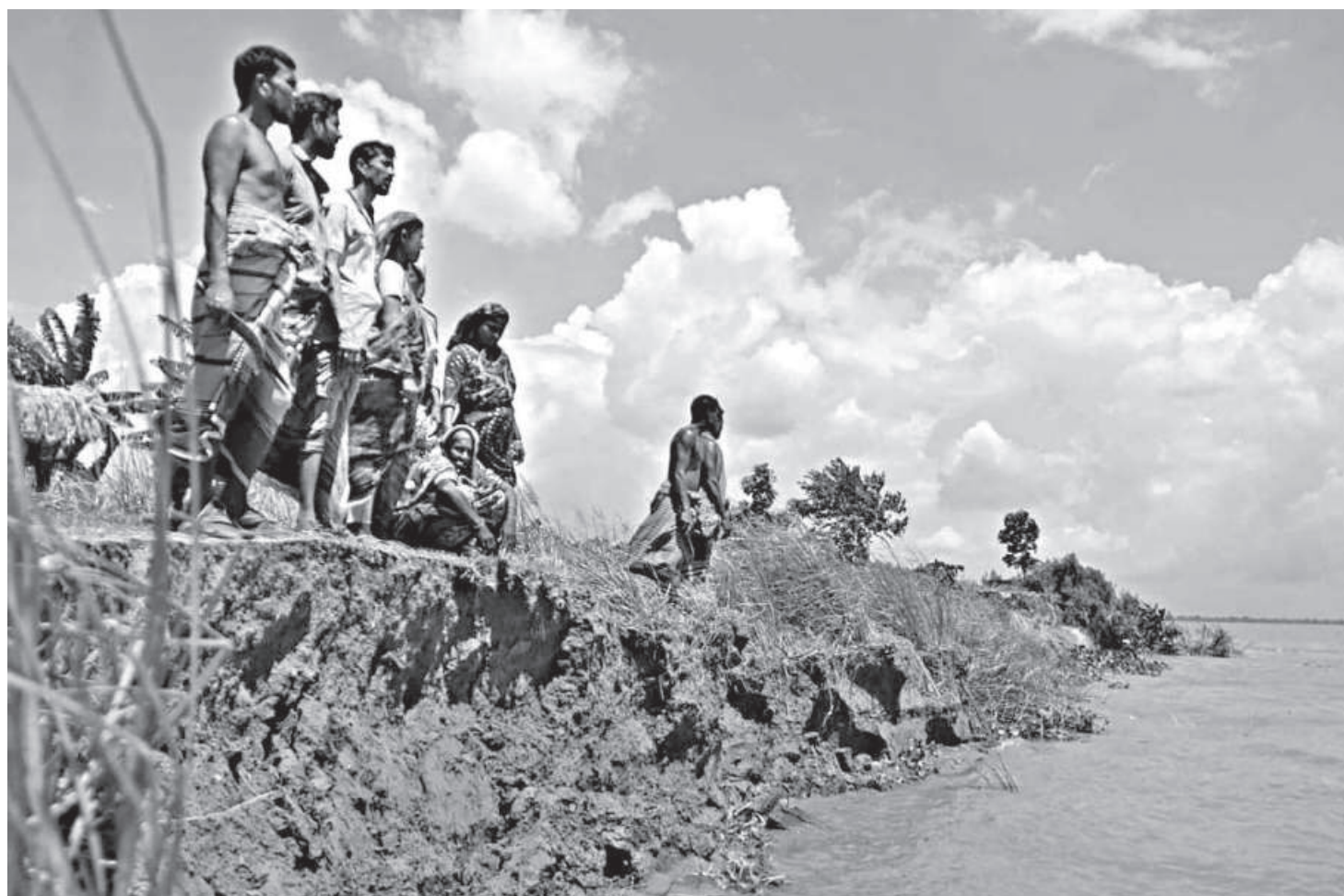
Looking out to the distance, residents in Faridpur Sadar have only one thing in their mind -- "Where will we go now?". Many have lost their homes twice now due to the erosion caused by the Padma. With no sustainable solutions in sight, they silently mourn their lost homes.