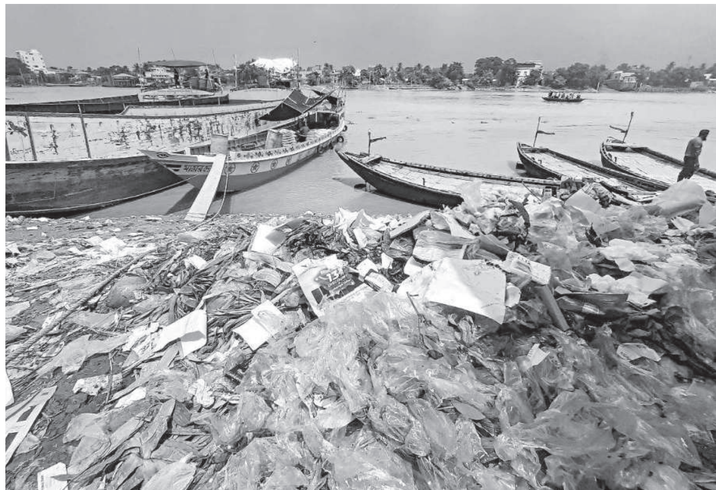
Plastic and organic waste continues to infiltrate the Bhairab river banks. When the river swells, much of it gets carried into the waterbody. As a result, the river keeps getting polluted. This photo was taken in Kalibari Kheyaghat in Khulna's Borobazar area recently.