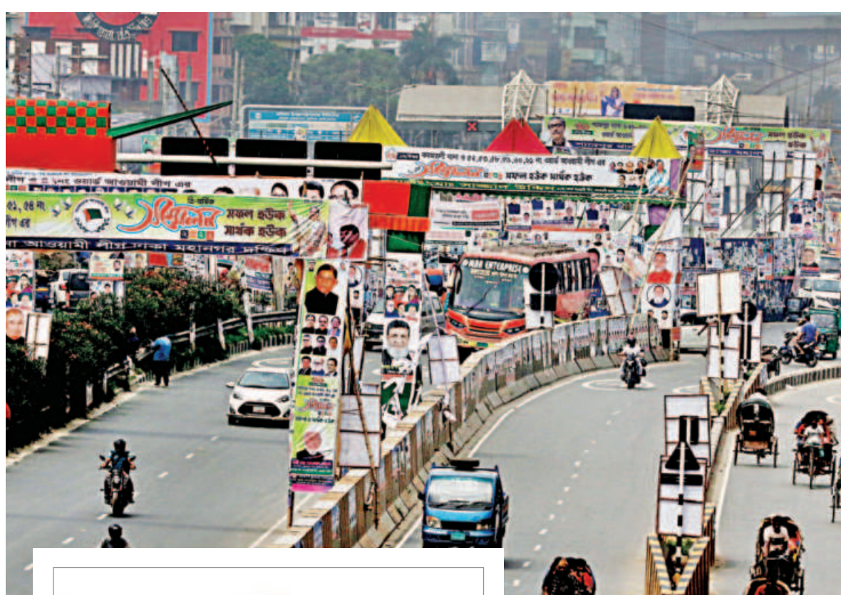
Arches have been built on both sides of the Jatir Pita Bangabandhu Sheikh Mujibur Rahman Highway in the capital's Dholaipar for councils for Awami League units. The councils ended recently but the posters and banners of AL leaders' own publicity remain. Inset, a footbridge in Dholaipar is covered with posters and banners. The photo was taken yesterday.