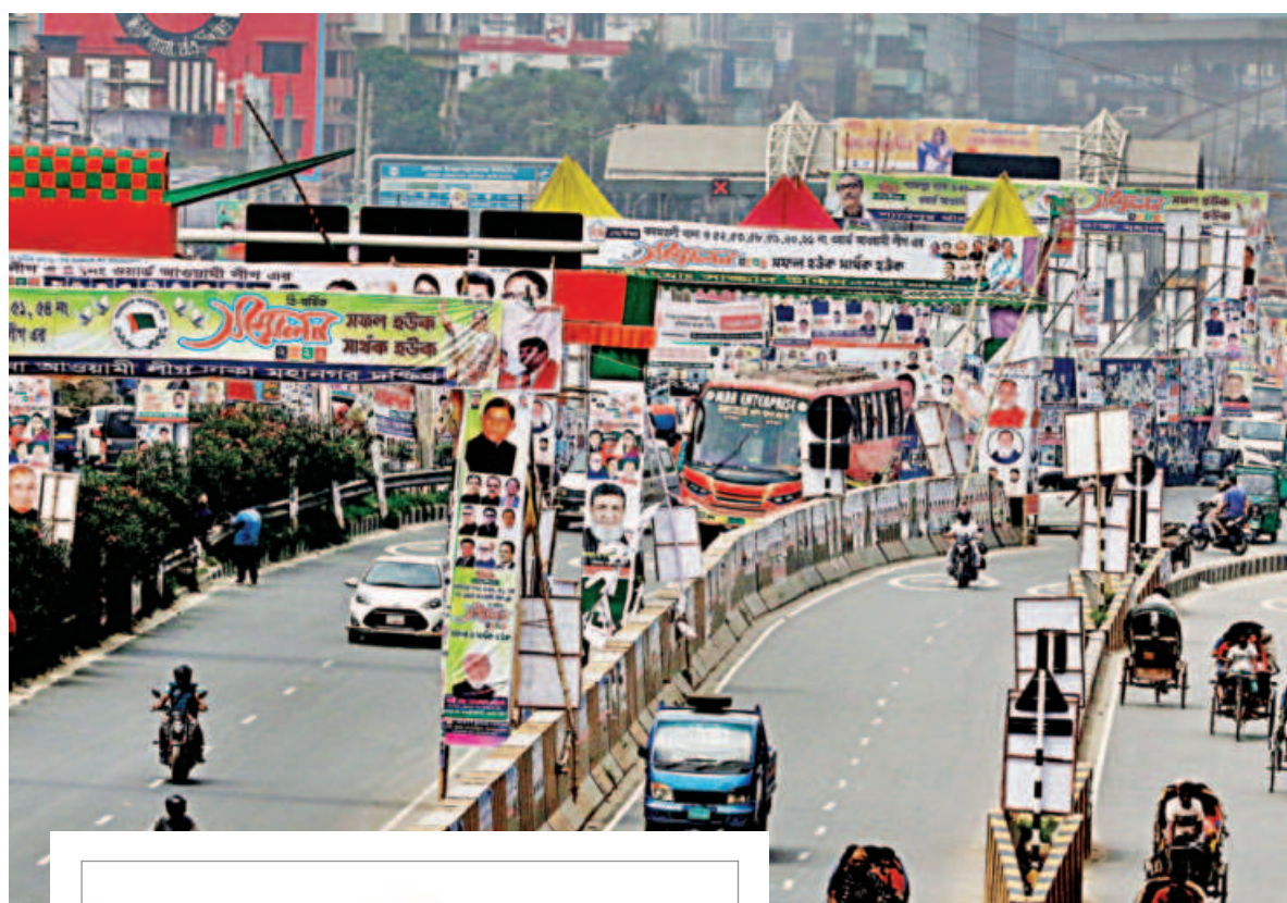
Arches have been built on both sides of the Jatir Pita Bangabandhu Sheikh Mujibur Rahman highway in the capital's Dholaipar for councils for two Awami League units. The councils ended recently but the posters and banners of AL leaders' own publicity remain. Inset, a footbridge in Dholaipar is covered with posters and banners. The photos were taken yesterday.