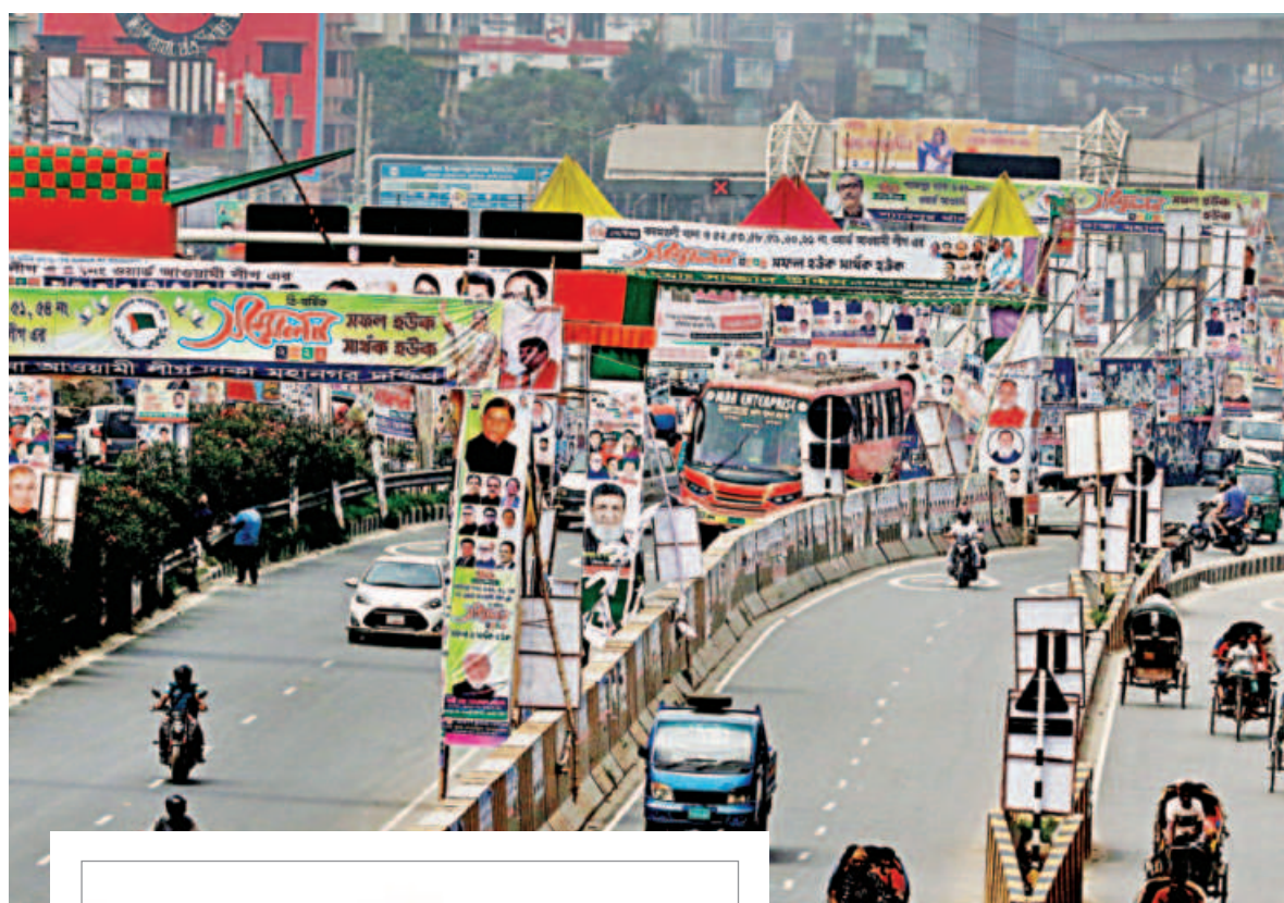
Arches have been built on both sides of the Jatir Pita Bangabandhu Sheikh Mujibur Rahman highway in the capital's Dholaipar for councils for two Awami League units. The councils ended recently but the posters and banners of AL leaders' own publicity remain. Inset, a footbridge in Dholaipar is covered with posters and banners. The photos were taken yesterday.